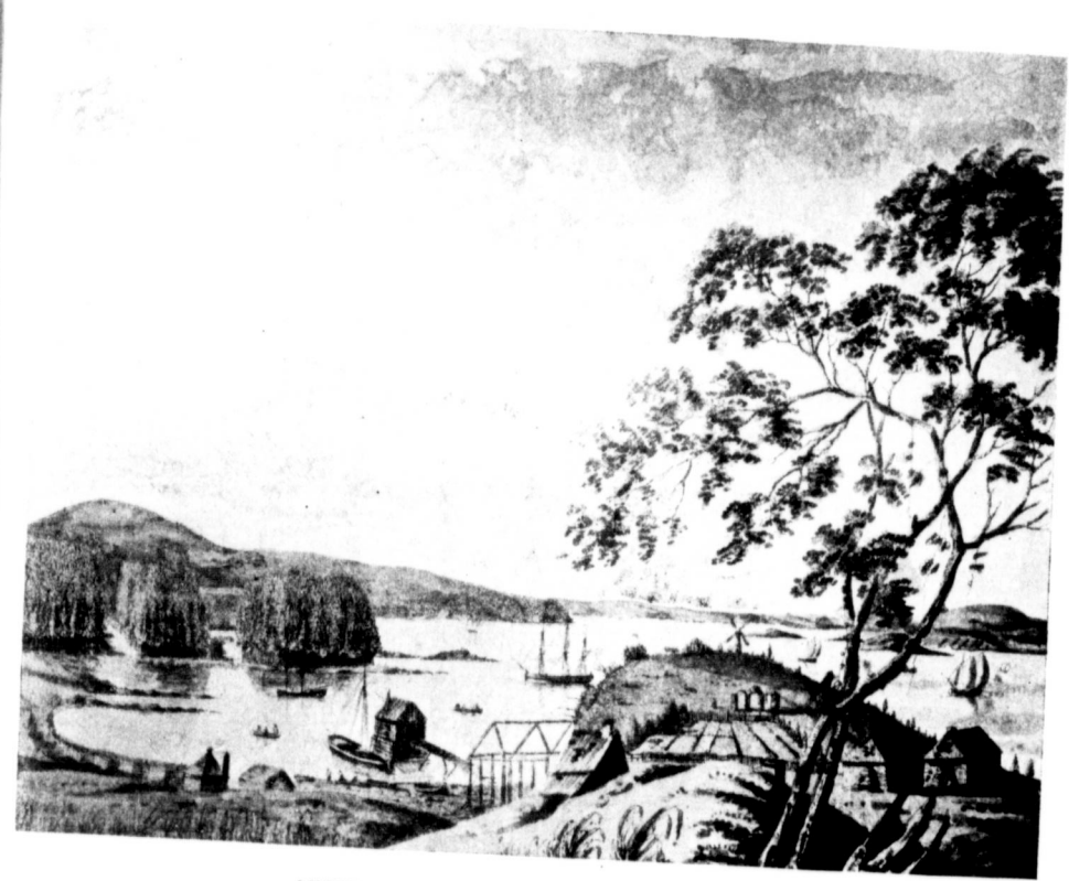
VIEW OF CAMPOBELLO, A. D. 1777.

ns are offered: nis Heirs, that igs, and a Lot