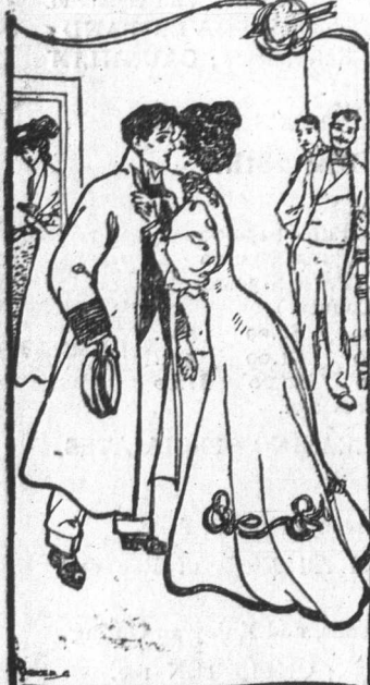
"OH, YOU DEAR BOY !" sympathize with the girl who saved

I do hate to get caught in a rain. And -and you know-or, rather, probably you don't know-it's a sort of life and death affair for a girl with a brand new hat and costume to get mixed up in a shower. Every true woman can