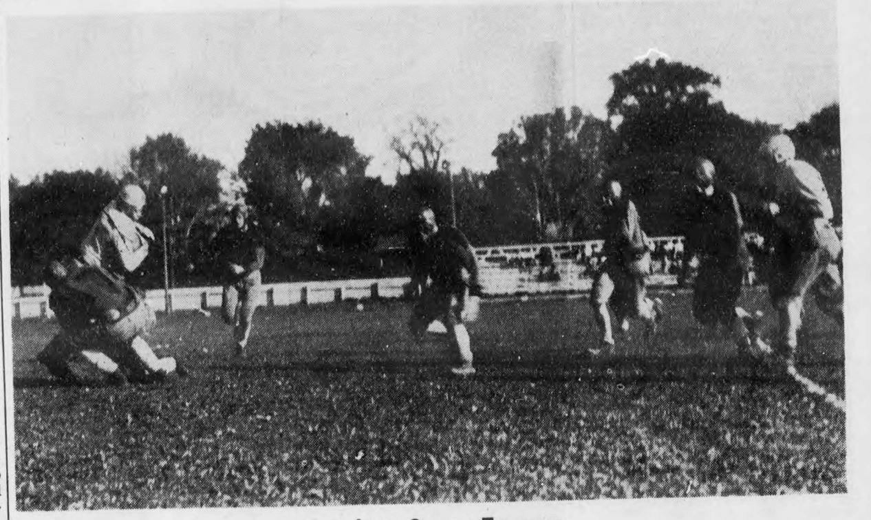
Bombers Smear Tommy

UNB kicked to the St. Thomas St. Thomas got three first