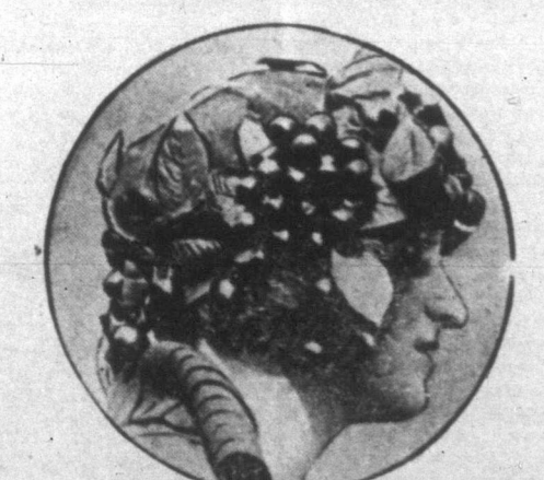
England's latest word in millinery. The hat trimmings are pinned to the hair.