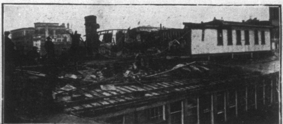
The roof of the United States treasury building, Washington, damaged by a mysterious fire.