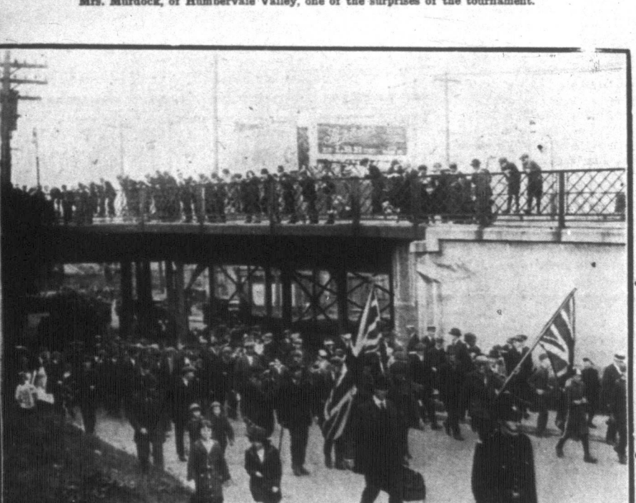
The return of the hikers to Toronto.