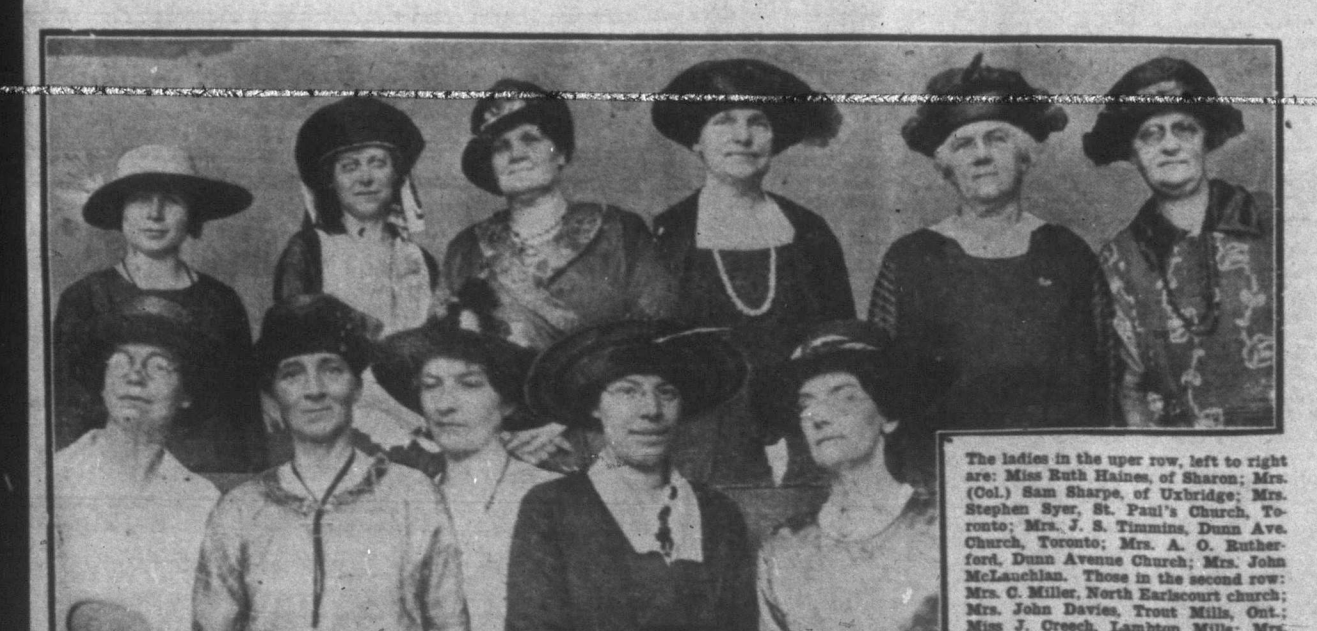
Methodists admit women to the floor of conference.