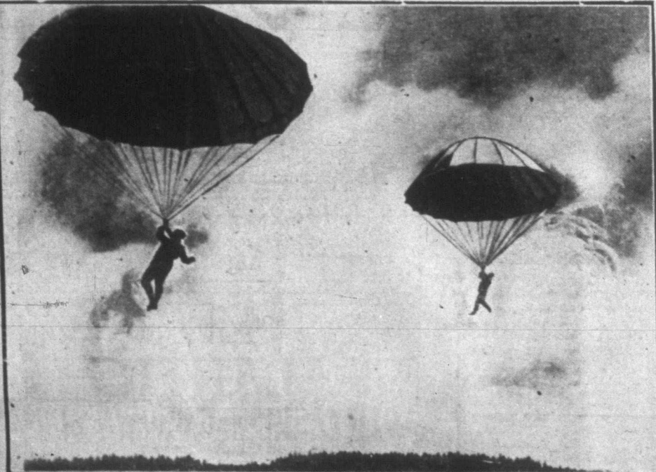
There are chases in German movies, too-this time in parachutes.