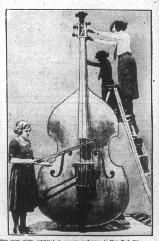
This giant violin, exhibited at a music conference in New York this week, weights 150 pounds and is 11 feet 7 inches high. The strings are as thick as a man's finger, and the bow is 30 inchs long.