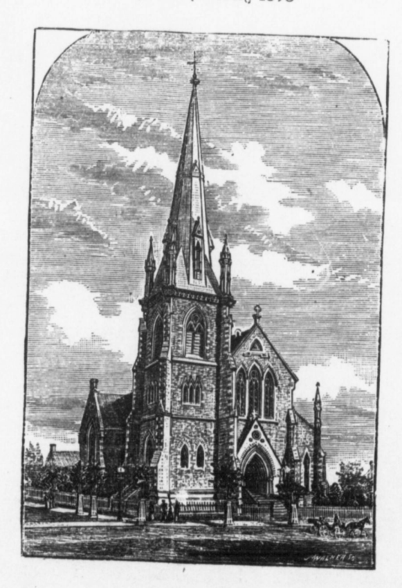
PRINTED AT THE OFFICE OF THOBURN & CO., 36 ELGIN ST. 1895

Published by order of the Annual Meeting of the Congregation held 4th March, 1895