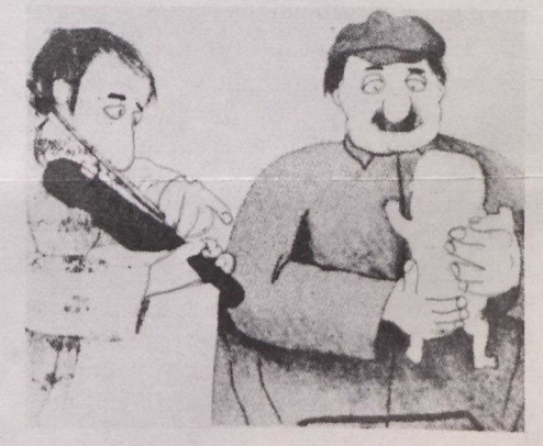
Nobody wants the baby in the NFB film Every Child.

Every Child was one of four National Film Board films nominated for academy awards. The other nominations were Bravery in the Field (live-action short), Going the Distance (documentary feature)