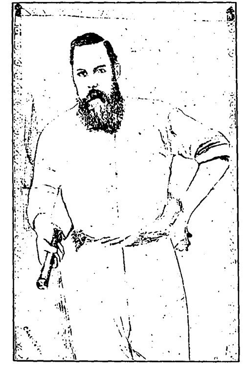
OUR YOUNG ARTISTS-DRAWN BY CHARLES COLES FROM A PHOTO.

When people are thinking so much of their earthly sovereign, are they giving their love to the King of kings? What a glad time it will be when every tongue and nation shall confess the Lord Jesus!