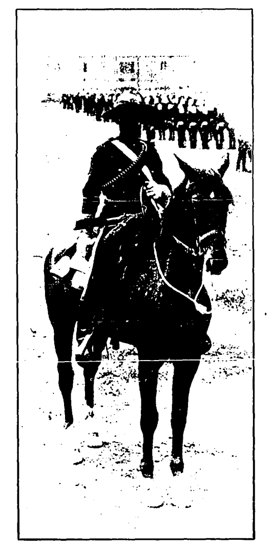
A GOOD SPECIMEN-STAFF-SERGT. BADGLEY, N.-W. MOUNTED POLICE.

established in this crude fortress, and for many years the even-handed justice which was dealt out from this most interesting transplanted