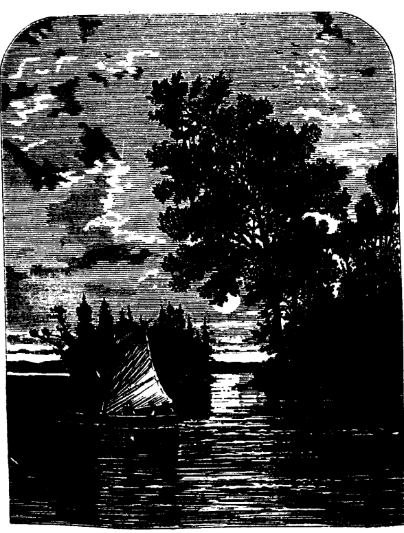
EAGLE'S NEST ISLAND, LAKE BOSSEAU.

' NO emancipate oneself, at intervals, from the toils of business, to determine to turn one's back upon the depressing influences of routine occupation, is now happily a recognised necessity. Quitting commercial and industrial centres and hieing off to give a fillip to the mind by a few weeks' recreation amid nature's solitudes is. moreover, a wise and laudable act, the mental and physical refreshment of which is well-nigh incalcula-Of places of deble. sirable resort there are many in Canada to which the wearied and over-worked business or professional man may hasten to take a bain de vie, and to reinvigorate his system, in a period of