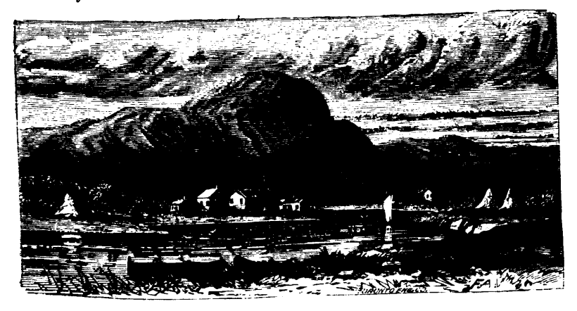
MCKAY'S MOUNTAIN, FORT WILLIAM.

This lofty promontory, 1,350 feet in height, is a very conspicuous ob ject at a distance of many miles. It first rises rather gradually, but steeply from the water, but finally terminates in a bold wall of chert or quartz. Its great height is hardly appreciated from the water on account of the cor-After rounding responding length. the Cape, we pass into Thunder Bay. which is studded with innumerable rocky islets, which may probably be as rich in mineral wealth as the one of which we have just spoken. About fifteen miles from the Cape we arrive at Prince Arthur's Landing, a settlement now rising to great importance, but which seems to have sprung up a few years ago, like Jonah's gourd, in Its situation is a fine one, a night. as the land ascends gradually, by ter