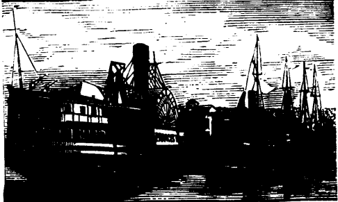
STEAMERS AT OWEN SOUND.

Papoose Islands lying to the northeast, and the Fox Islands further inland, we at length come upon the Great Manitoulin, and sight a light-house on the rocks, apparently out of reach by water. Behind it rise, like petrified sea-billows, immense waves of granite of the Still further in Huronian formation. the rear lie the La Cloche Mountains, ranging from 1,000 to 2,000 feet in height and stretching along the whole northern shore. The whole coast from this point to the Sault Sainte Marie is full of craggy headlands, and rugged indentations and inlets. The channel is studded with innumerable islands of all sizes, forms, and degrees of ele-There are said to be 3,600 vation. of them between the points we have mentioned, and 23,000 altogether from Parry Sound to Fort William, on Lake On reaching the narrow Superior. coast of which we have spoken, we find there is a narrow passage-narrow, but deep and safe. The Indians call it Shebawanahning, that is to say, "here is a channel." Into the inlet we glide, with the high rocks of the island on the one hand, and the heavy masses of the La Cloche Mountains on the other, to find a very quiet little settlement called Killarney. This is a little fishing-place, not very interesting in itself—a quiet nook in the rocks. like some kindred spots, it is said, in old Normandy and Brittany. The Indians flock about on the arrival of the steamer with their little curiosi-