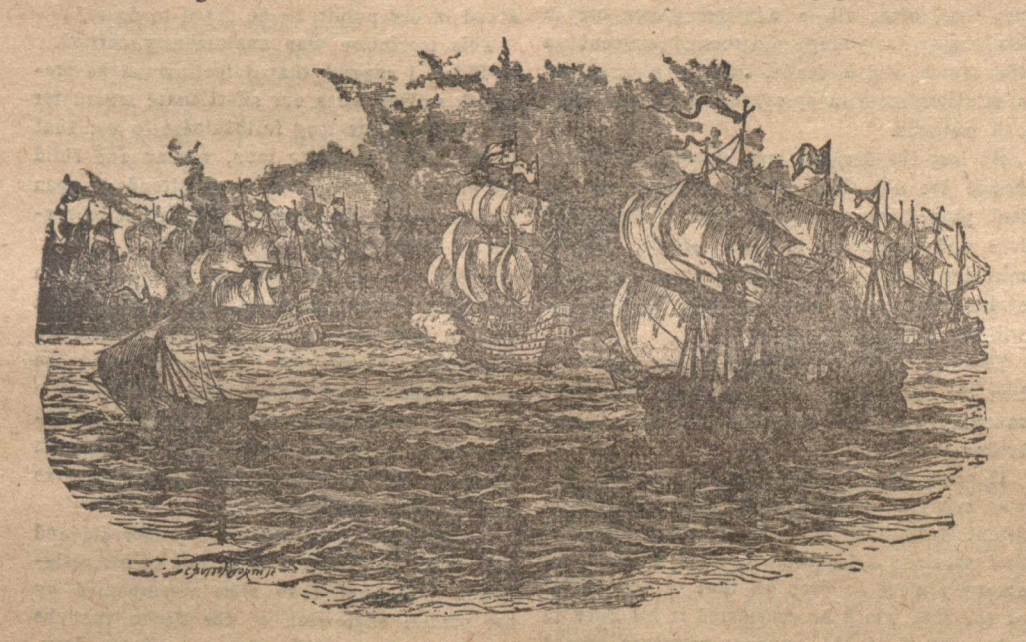
THE ENEMY'S FLEET CAME UP IN THE NIGHT.

We bade one another "Good-by," but I felt that I must see the teacher again before he left Chicago, and so I met him at the station, and while we were talking one of the girls came along and then another until the whole class had assembled. They were all there on the platform. It was a beautiful summer night. The sun was just setting down behind the western prairies. It was a sight I shall never