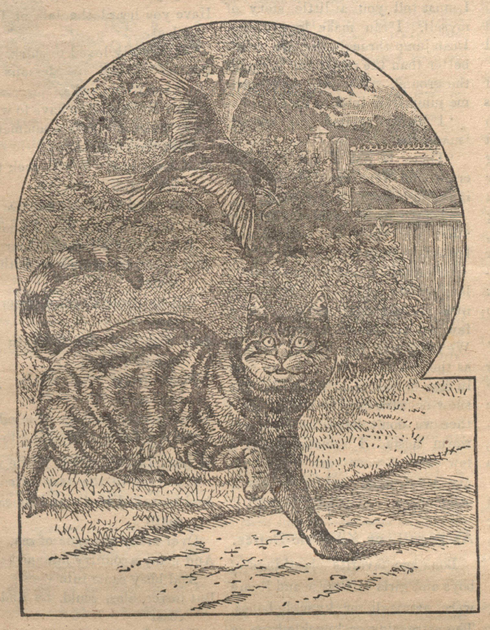
Parental Devotion of a Thrush.

thrushes, and carried off the young birds in sight of the parents, has since become an object of peculiar attention on the part of the latter,