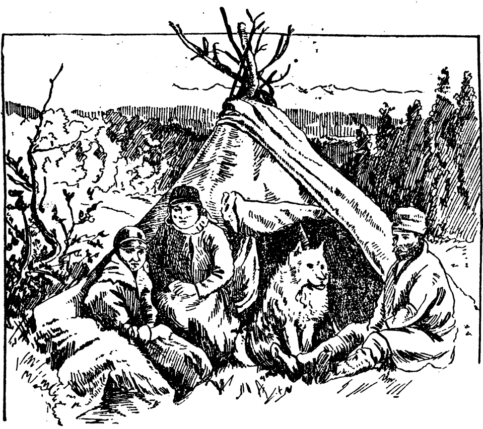
A FAMILY OF LAPPS.

Every day you shall wonder at yourself, at the richness of life which has come in you by the grace of God. There is nothing which comes to seem more foolish in us, I think, as the years go by, as the limitations which have been quietly set to the moral possibilities of man. They are placidly and perpetually assumed. must not expect too much of him,' it is said. 'You must remember that he is only a man, after all,' 'Only a man!' That sounds to me as if one said, 'You may launch your boat and sail a little way, but you must not expect to go very far. It is only the Atlantic Ocean.' Why, man's moral range and reach is, practically, infinite, at least no man has yet begun to comprehend where its limits lie. Man's powers of conquering temptation, of