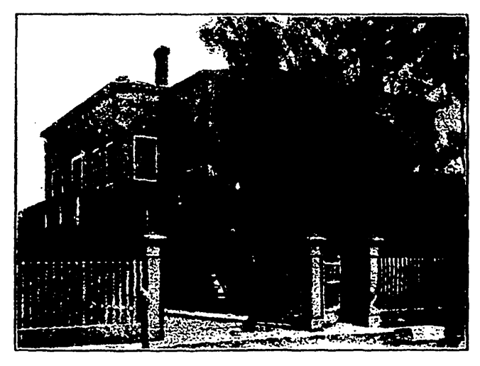
THE WESTERN HOME, AS IT IS TO-DAY.