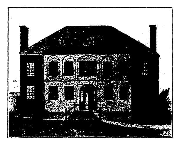
THE OLD GAOL, AS IT WAS 60 YEARS AGO NOW THE WISTERN HOME.