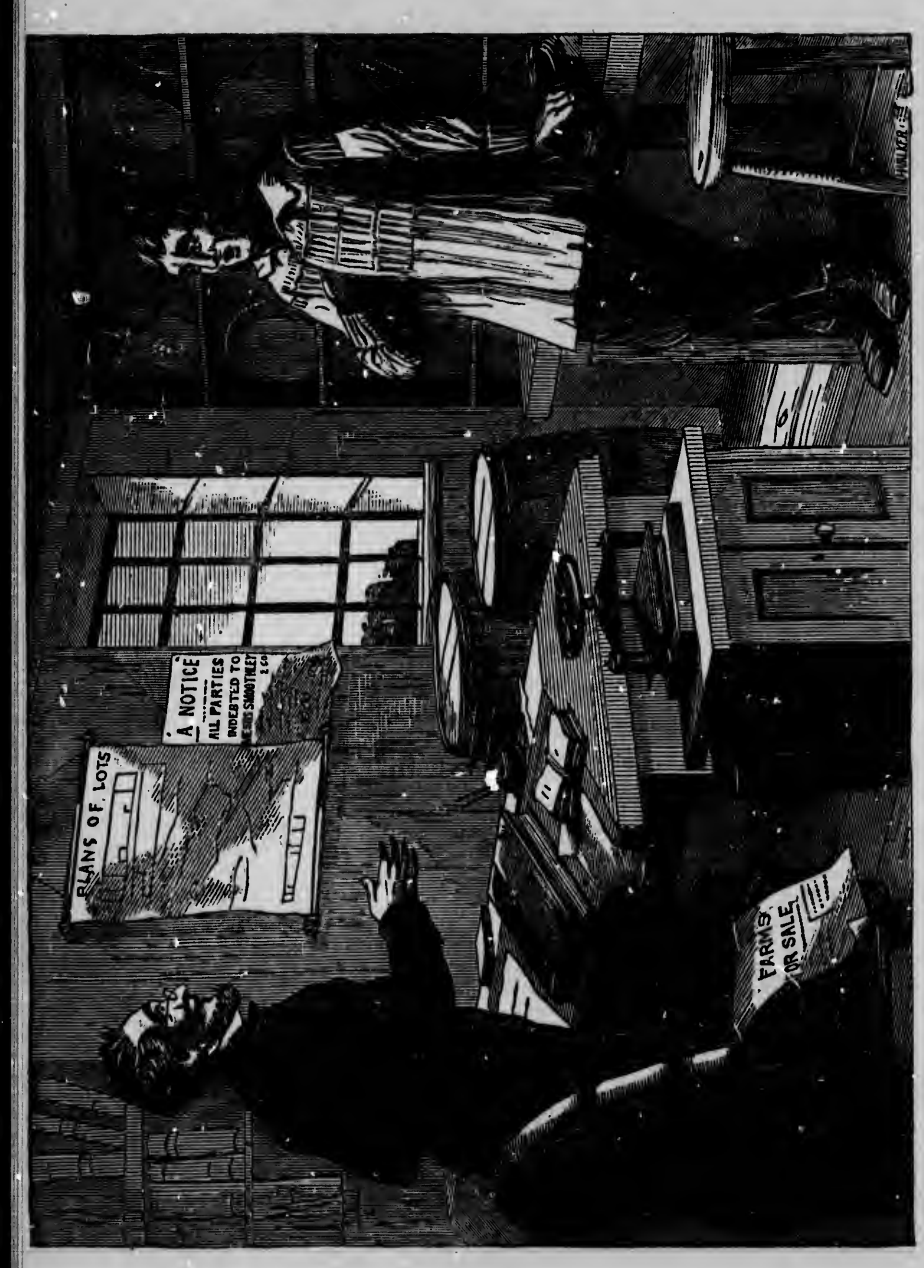
"My simple, honest Sir," said he, "you don't, sure, understand; You're in the Eastern Townships, mind,—not in your native land; All things are here so different!—you really must show sense,—