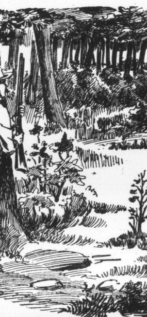
THE FISHER BOY'S TRYING ORDEAL.