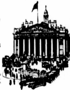
Head Office: Royal Exchange, London

Correspondence invited from responsible gentlemen in un- represented districts re fire and casualty agencies