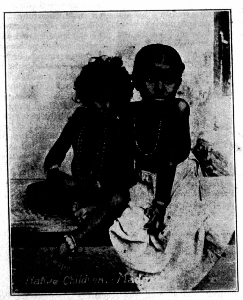
TWO CASTE GIRLS