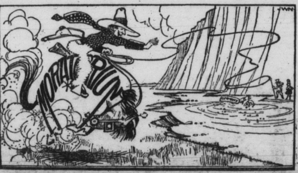
AMERICA MAY YET PROVIDE A THRILLING RESCUE SCENE

more than $500,000,000 since the Arm stice.