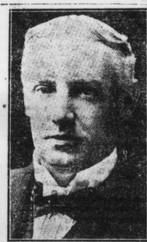
Sir Donald MacLean