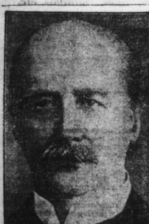
Britain's new Lord High Chancellor, colleague of Premier Bonar Law.