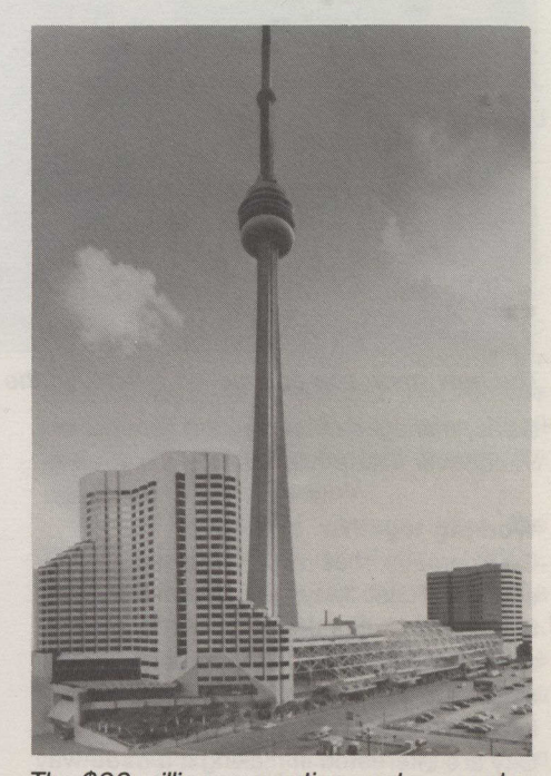
The $90-million convention centre complex in Toronto, with the impressive CN Tower in the background. The centre, which hosted its first convention this summer. can accommodate groups of up to 12 000.

The Canadian dollar vis-a-vis its US counterpart has provided added incentive for groups considering an event in Canada, and