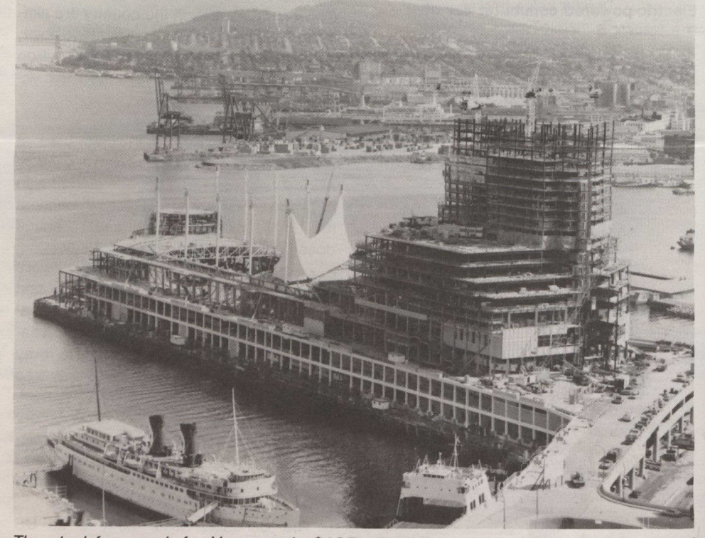
The steel framework for Vancouver's $137-million convention complex was completed in early July of this year.