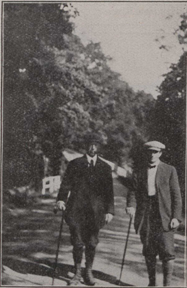
"Hitting" the Splendid New York State Road.

However, we noticed that all the hotels were willing to take the good Canadian money—without discount. This, however, is only true until one reaches Plattsburgh. South of that town Canadian currency is accepted only at a discount. The U. S. were anxious for reciprocity, but only in natural products, and "greenbacks" are not regarded as in this category.