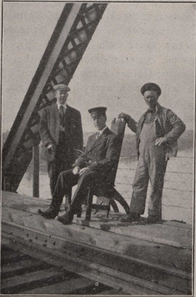
Crossing the St. Lawrence at Cornwall.

In order that the trip might be a "walking" one, pure and simple, we determined, if possible, to cross the river on the railway