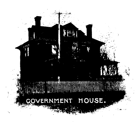
At Edmonton, Alberta