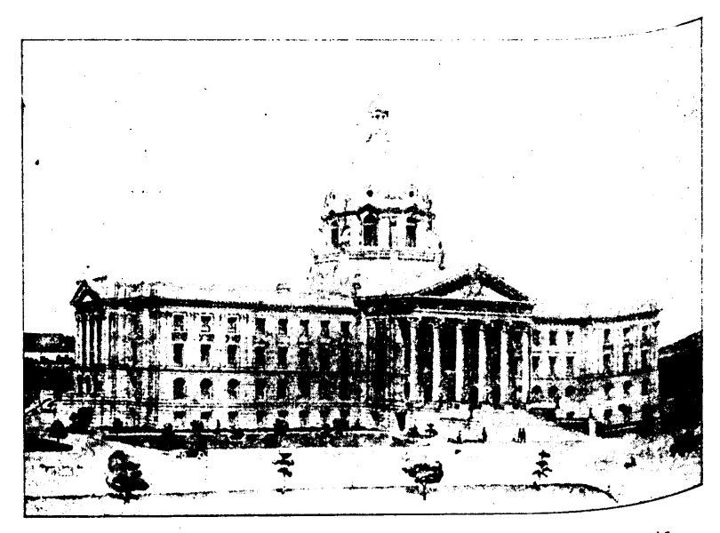
The New Provincial Parliament Buildings, Edmonton, Alberta