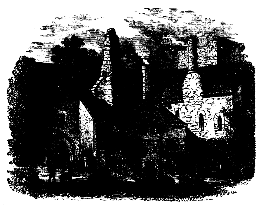
REMAINS OF VALLE CRUCIS ABBEY.

the difference between this valley and the Alpine ones with their trim, clean toy houses, or the Transatlantic ones with their square, solid, black log huts and huge well-sweeps; otherwise the fresh greenery, the purple mountain-shadows, the subdued sounds, no one knows whence, the sense of peace and solitude, are akin to every other beautiful valley-scene of mingled wildness and cultivation. A traveller can hardly help making comparisons, yet much escapes him of the peculiar. charm that hangs round every place, and is too subtle to disclose itself to the eye of a mere passer. You must live at least six months in one place before its true character unfolds: the broad beauties you see at once, but it needs the microscope of habit to find out the rarest charms. Therefore it is much easier to descant on the tangible, striking beauty of Valle Crucis Abbey than on the aggregate loveliness of Llangollen Vale; and perhaps it is