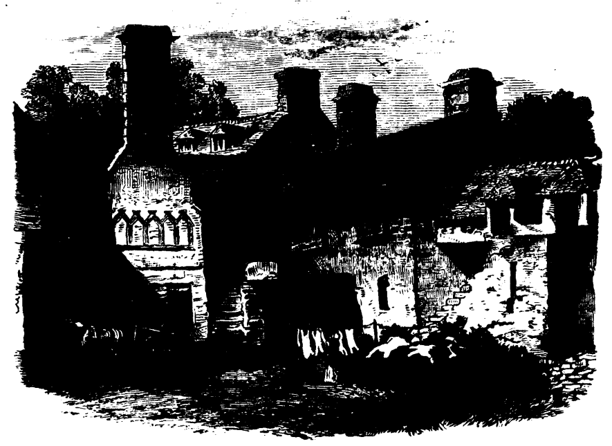
THE PARLIAMENT HOUSE, DOLGELLY.

makes it a pleasant picture, while here and there, as at Overton (this is Welsh, however, and belongs to Flintshire), a church-tower comes in to complete the