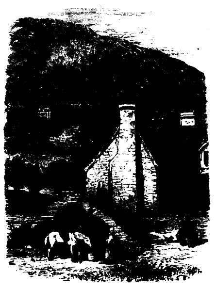
OWEN GLENDOWER'S PRISON.

up for the want of tracts of wooded land. This country is not, like the Midland counties and the great Fen district, violently or exclusively agricultural, and these hedges and trees, which are gratefully kept up for the sake of the shade they afford to the cattle, show a very different temper among the farmers from that utilitarianism which marks the men of Leicestershire, Lincoln, Nottingham, Norfolk, or Rutland. There even great landowners are often obliged to humour their tenants and keep the unwelcome hedges trimmed so as not to interpose