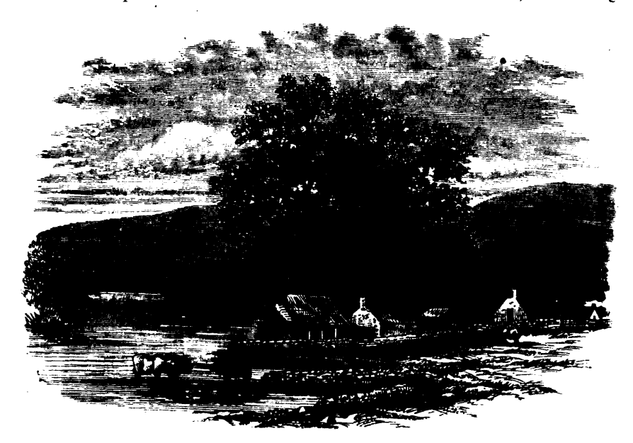
IN THE VALE OF LLANGOLLEN.

pleasant reminiscences of such places. How much more interesting to find an old tomb or quaint 'brass' under the temple of a wild rosebush or in the firm clasp of an ivy-root than to walk up to it and read the inscription newly scraped and cleaned by the voluble attendant who volunteers to show you the place! The great elms by Overton Church and the half-timbered and thatched houses crowding up to its gates somewhat make up for the splendour of the coped wall and new monuments in the churchyard. A scene wholly old is the Erbistock Ferry, which one might mistake for a ropeferry on the Mosel. The cottage looks like the dilapidated lodge of an old monastery, and here, at least, is no Two walls with a flight of trimness. steps in each enclose a grass terrace between them, and trees and bushes straggle to the edge of the river, hardly keeping clear of the swinging rope. Coracles are sometimes used for ferrying—also punts. Bangor is a familiar name to students of church history. and to those who are not, the startling