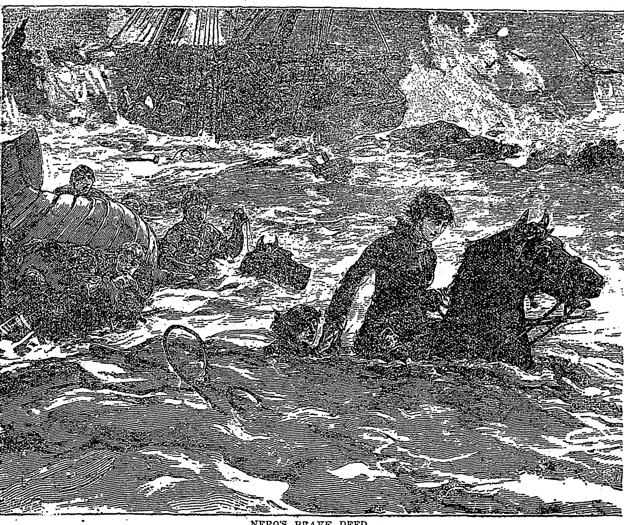
NERO'S BRAVE DEED.

Years ago, I was at a Methodist conference in a Western city as a reporter. The young men who were about to be ordained were telling their experiences and their ashamed to call you my son,' she said hopes before an immense and interested promptly. 'Oh, to think you could dream assembly. One young man—whose home was in a great grape-producing district—said, among other things: "When the Master comes, I do not wish him to see me sitting beside an empty basket." I recall the phrase at the distance of the year. And I ask myself seriously, "When I reach the end of life's journey, will he find me with an empty basket?" He shall not, if I can help it. I will try to spare him the sorrow, and myself the mortification. If I can, I will lade my basket to the very handle with soul-fruit, for his glory.—Golden Rule.