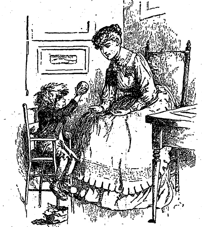
"HERE'S AN ORANGE I BRUNG YER."

orful lot o' red tape t' git me in." Here he withdrew with infinite trouble from his ragged pocket an orange, or at least the remains of one, which seemed to