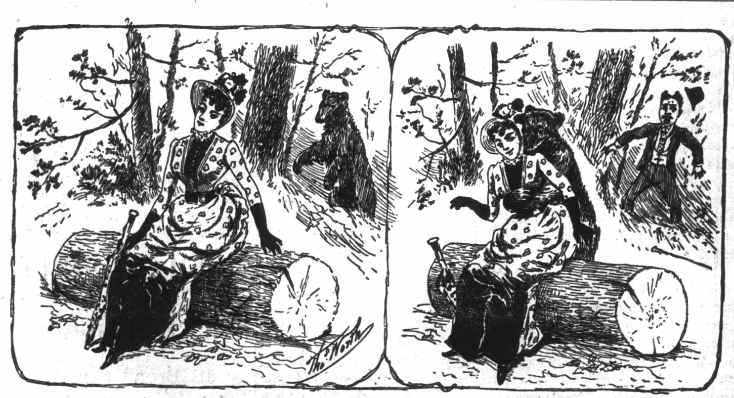
"There are Moments when One Wants to be Alone."