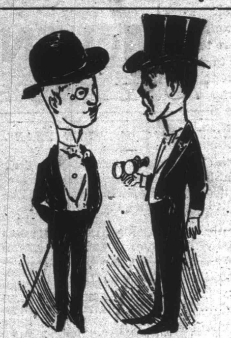
GOING TO THE BANQUET.