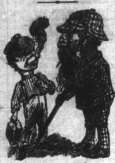
A LATE ARRIVAL.

upon the narrow peninsula known as Lake is open to navigation the whol year, but Kootenay River from Bonner's Ferry to the Foot of the Lake, and the Kootenay outlet from Balfour to Nelson, are not navigable for about three months of the year, from about the 1st of January until about the 1st of April. A line of railway from Balfour to Nelson will give Nelson an allyear trade with the Kootenay Lake.