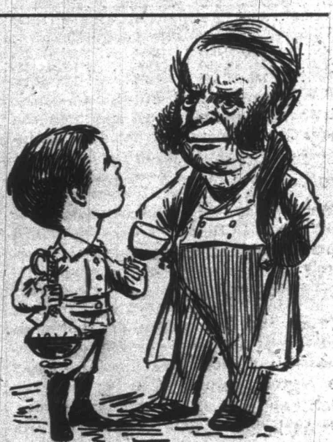
THE MORNING AFTER-My boy, take an old man's advice, and never attend a barristers' banquet. More