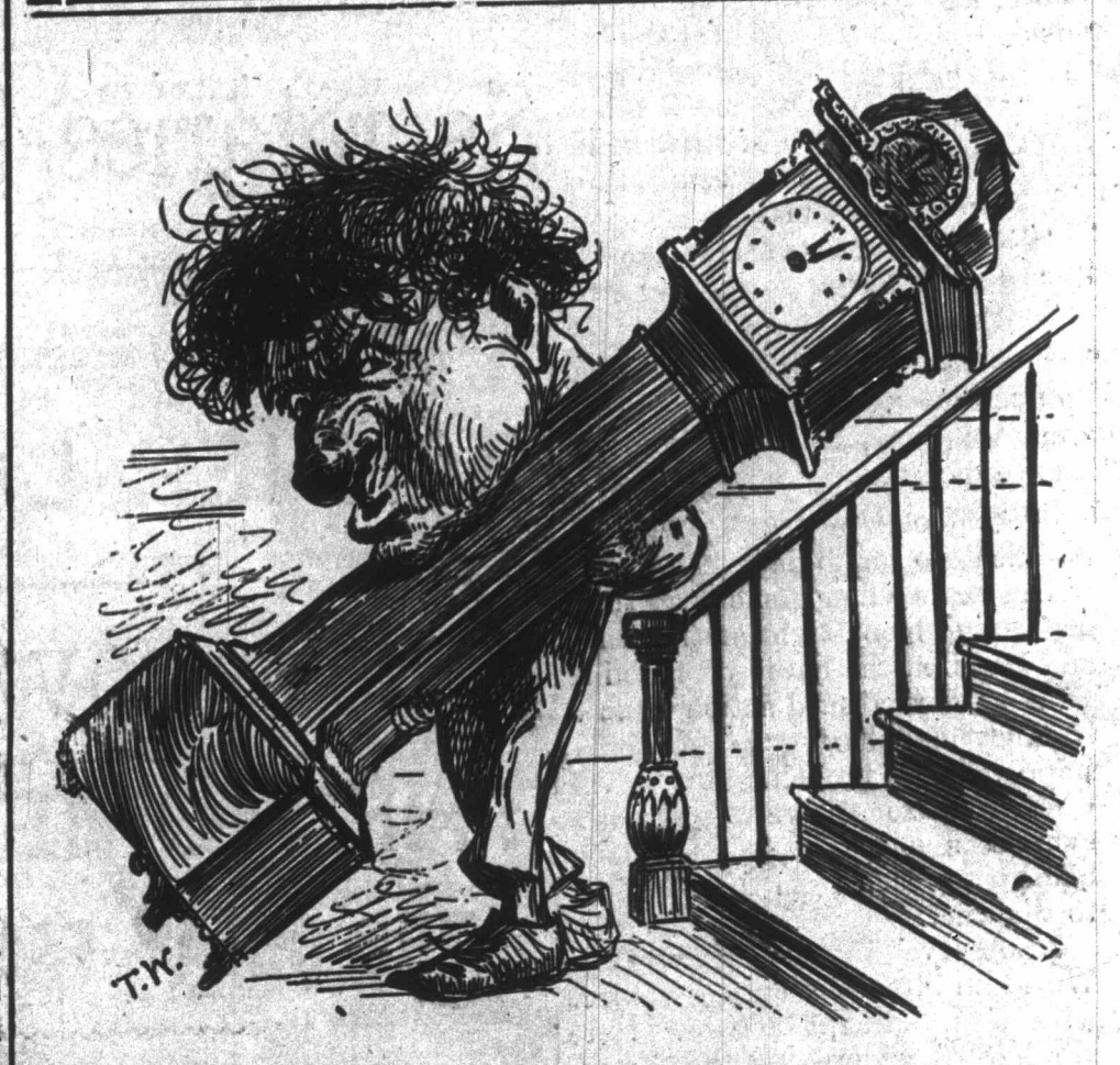
A LEAP YEAR MOTTO-" TIME FLIES."