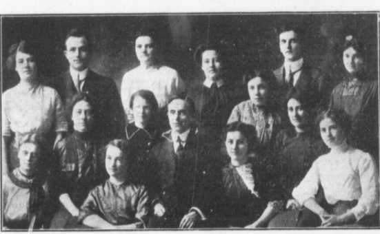
TEACHER TRAINING CLASS, SASKATOON, SASK.