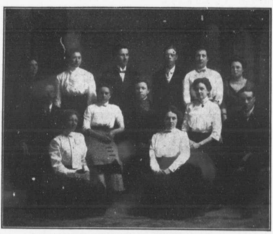
THE SEAFORTH EPWORTH LEAGUE MISSION STUDY CLASS

To meet the need Bible Training Classes were organized, in which fully one-sixth of the entire membership of