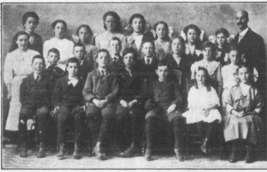
THE JUNIOR LEAGUE, CARBERRY, MANITOBA.

Once a lady dreamed that she went to church, and as the people were going away they found some one standing at the door holding a plate for the gifts of the people. It looked like an ordinary plate, but it had the power of changing each gift into its real value in God's A gentleman put in a ten dollar sight. gold piece, which at once turned into brass. It had no value in God's sight, because the gentleman had given it in order to be thought well of by others. Then a lady put in a quarter, which rnen a lady put in a quarter, which turned quickly into a penny. God knew she could give more, and she gave only because others gave. Then a little Sun-day School girl came up with her teacher and dropped in a penny, and this turned into a daisy. She had given it just to please her teacher. The lady in her dream felt