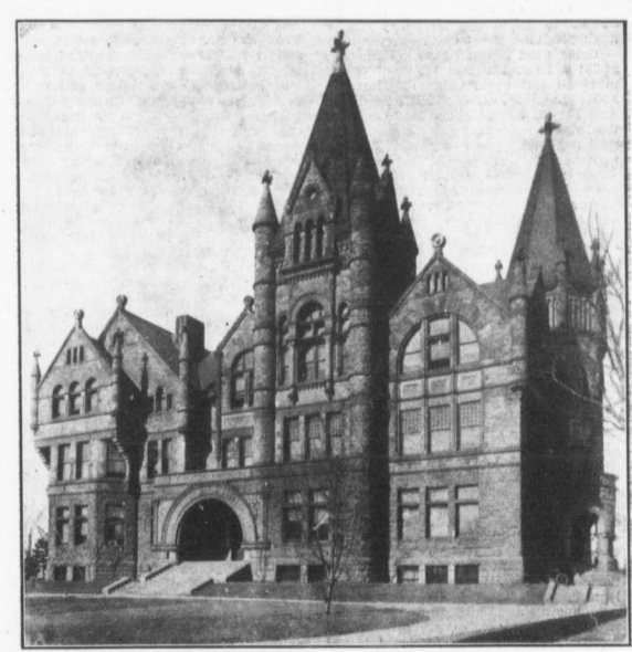
VICTORIA COLLEGE, QUEEN'S PARK, TORONTO.

conditions which create the unfit." In caring for the poor, the sick, the neglected, the defective, and the delinquent, it is well to remember that "An