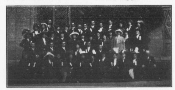
GROUP OF DELEGATES AT STRATFORD DISTRICT E. L. CONVENTION, ST. MARY'S.

Then purity has another side: that of single-minded devotion to right, because right is right; a purpose to keep the shield of faith unsuilled with wrong doing; to keep clean from untruth and dishonor and all things small and mean. And this is no small thing to gask. We must seek first small thing to gask. We must seek first For His sake we must choke back the hasty speech, the angry retort, the unfind instinuation; we must speak no evil, nor listen to it. We must be good to live with the Christianity that doesn't help us so is and white colors should haspire us to be strong and brave, to live lives pure and clean, to show forth our Saviour's life in our characters as well as His death by our confession of faith, and to follow Him who "went about doing good."