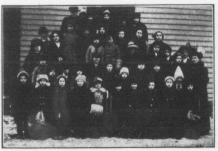
THE JUNIOR LEAGUE, BROWNSVILLE, ONT.

Brownsville had some similar society for the boys and girls of Methodist the Church. The same wish is same here expressed. for surely what one small lage can do others can also. There are girls and boys in every congregation throughout Methodism that should be tained to church through the influence of such a League; but in too many instances