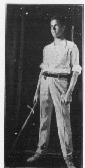
A SCION OF NOBLE STOCK.

For he is at once English, Irish, Scotch, French and United Empire Loyalist; and these, as everybody knows, are the five rich streams whence Canada's blood was first borrowed. From his French for-