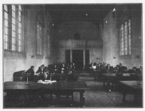
INTERIOR VIEW OF VICTORIA COLLEGE LIBRARY.

From the first the history of Roman Catholic missions has been one of persecution. It has been estimated that the number of Christians in the Roman Catholic Church in 1856 was about sixty thousand. Through the friendliness of the last king of the Yi dynasty (who died in 1864), the Roman Catholics gained influence over the affairs of the kingdom. The new ruler was opposed to foreigners, and resented the political influence of the Roman Catholic missionaries. A bitter persecution was begun, in the hope of