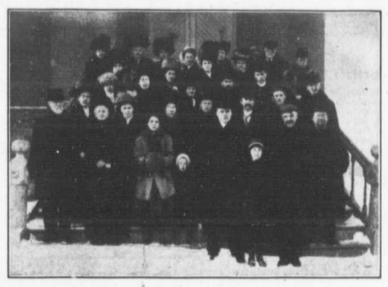
BRADFORD DISTRICT SUNDAY SCHOOL INSTITUTE.

"The Secretary reports 26 societies, of which 21 are Leagues and 5 Young Peo-ple's Societies, with a total membership of