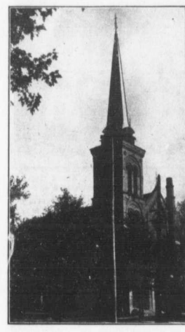
METHODIST CHURCH, ST. MARY'S, ONT.

teaching has permeated, a promise is held to be a sacred thing. It is encouraging that even where men are not very parathete where men are not very parathete with the promise given would be likely to be kept. I think observation will also establish this, that men will do more under a promise that we will do more under a promise that we have the pledge. I know a man who is living a Christian life to-day who is doing so because he promised his mother before a promise is held to be a sacred thing, and a promise is held to be a sacred thing, and a promise is held to be a sacred thing, and a promise is held to be a sacred thing, and a promise is held to be a sacred thing, and a promise is held to be a sacred thing, and a promise than without it, we ask our There is much involved in this pledge. Great are the blessings sure to come to those who take and keep it. I was the custom in Greek and Roman times for men nobles to give a pledge to a friend. To anyone who received the pledge was given the friendship and support, if need be, of a pledge from a great noble. To those who take and keep the League pledge great things are offered. The one who takes this pledge, and honestly tries to keep It, will accept the pledge was fiven the pledge of the pledge great things are offered. The one who takes this pledge will be assuredly among the most useful in the world. They who take and keep this pledge will be those whom a keep this pledge will be those whom