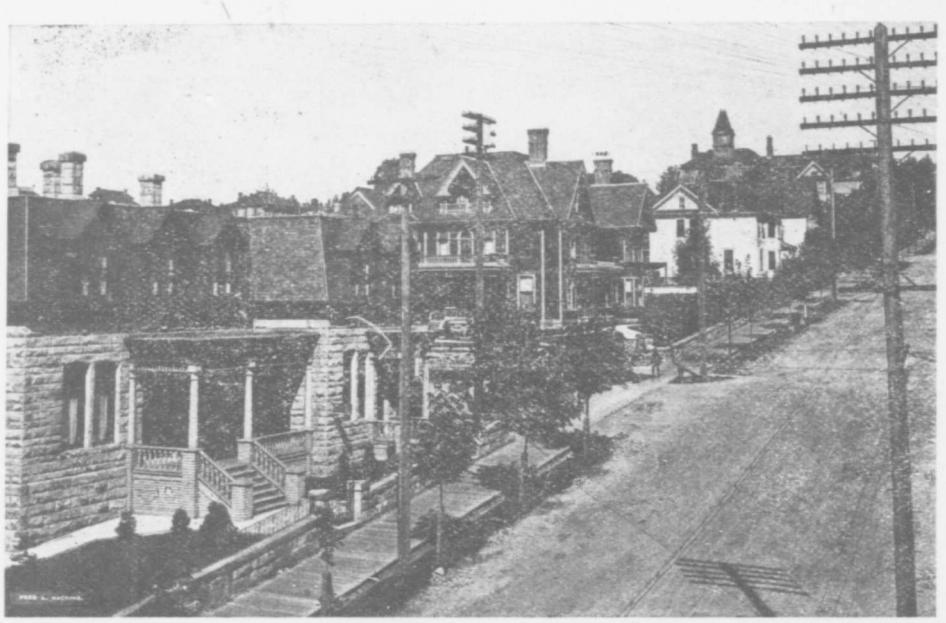
A Residential Street in New Westminster