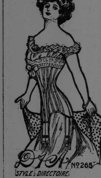
F. A. DYKEMAN & CO., 59 CHARLOTTE ST.