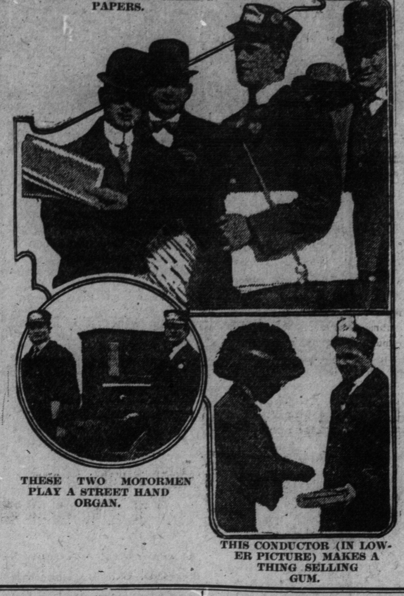
THESE TWO MOTORMEN PLAY A STREET HAND ORGAN.