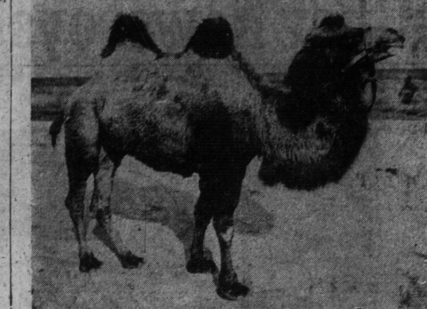
NELLIE The wonderful "Ben-Hur" camel, to be seen at the Princess next week.