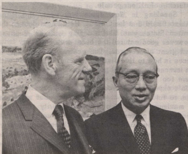
The Honourable Mitchell Sharp, Secretary of State for External Affairs, (left) chats with UN Secretary-General U Thant on August 24.

It is a fortunate thing for Canada that your meeting here coincides with the twenty-fifth anniversary of the United Nations, and that it gives us another opportunity to welcome the Secretary-General whose name and work are honoured throughout the world. Of all the attempts to bring order into the world community, going back as far as the Pax Romana , the