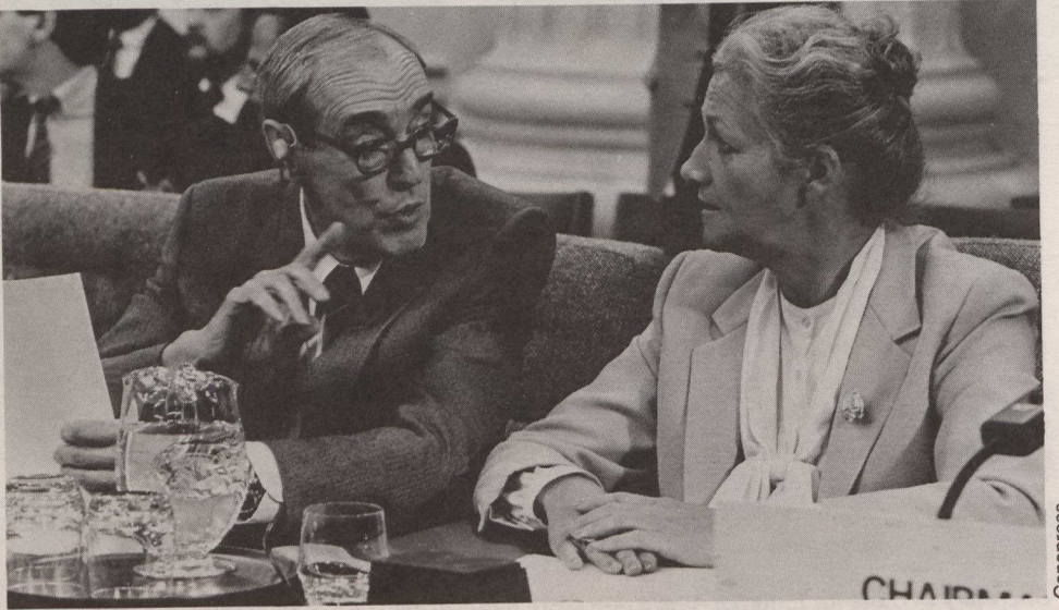
Minister of External Relations Monique Vézina (right) with CSCE Executive Secretary Louis Rogers at a meeting to set the agenda for the human rights conference.

Mr. Davis estimates that the hydraulic system will result in a 27 per cent fuel saving and a corresponding reduction of emissions. The cost of a unit is difficult to estimate because it is not in commercial production, but buying such a unit and retrofitting a bus would cost between $10 000 and $20 000, he said.