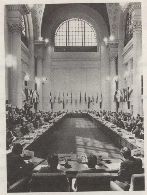
Representatives of the 35 countries at the opening of the two-week preparatory meetings prior to the CSCE conference in Ottawa.

Nor must we forget that our journey in search of greater respect for human rights is already well begun. There already exists an impressive body of legally binding United Nations instruments on human rights. We have all freely subscribed to the painstakingly