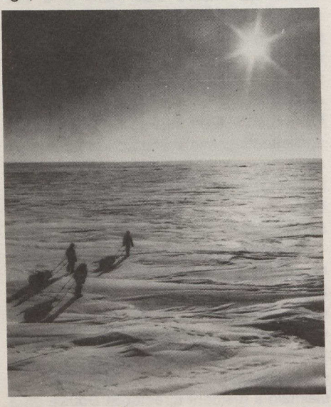
The team used the sun as one of the guides in the journey to the pole.

They used an astrocompass similar to the ones used by Arctic explorers 100 years ago, and also determined the position of