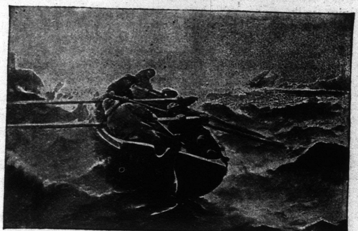
[From Sykes' Elementary English Composition. Loaned by courtesy of the publishers, Copp, Clark Co., Toronto.]

Write a story of what you see in this picture.