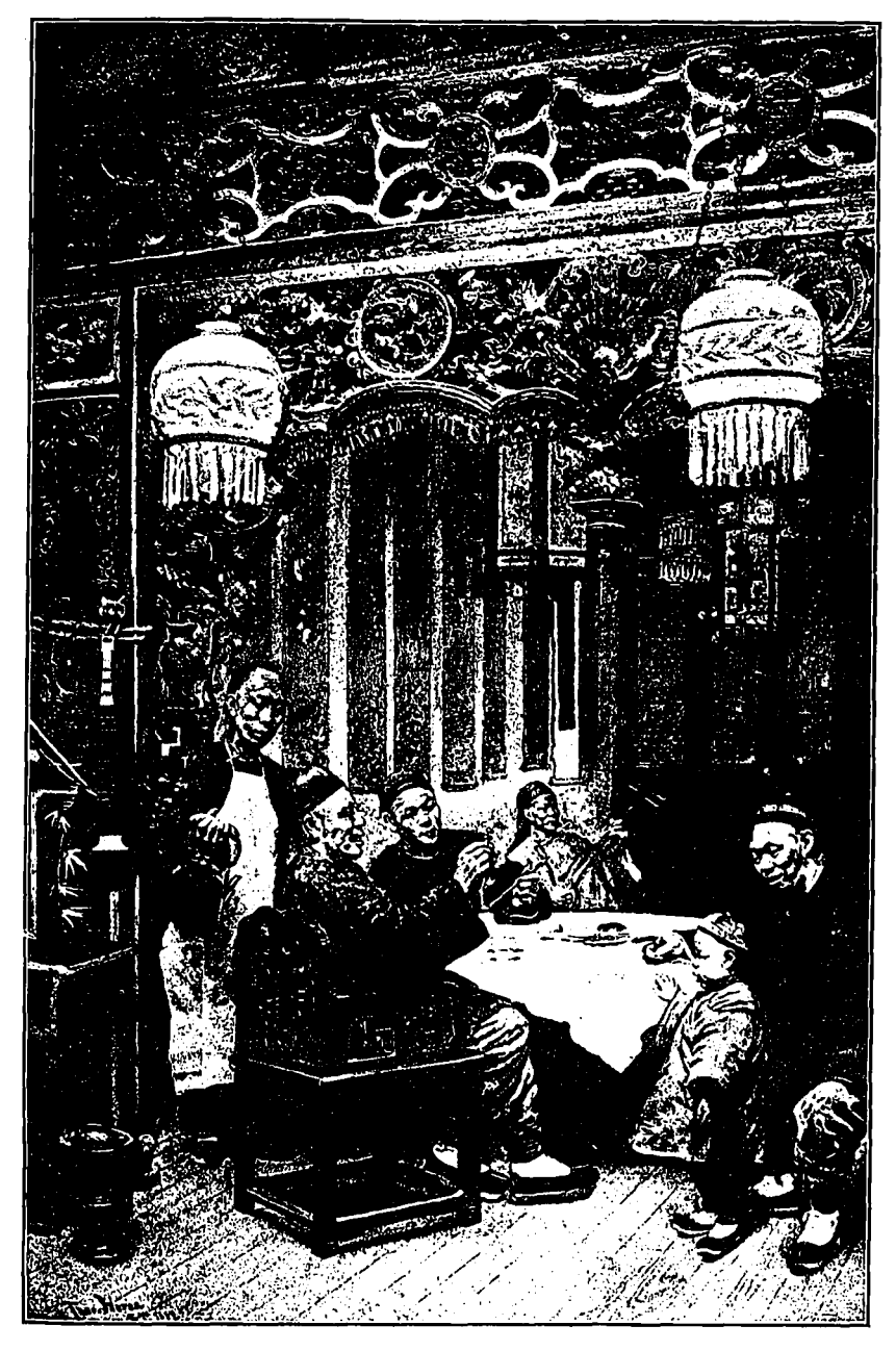
Engraved by BINNER ENGRAVING CO., Chicago.