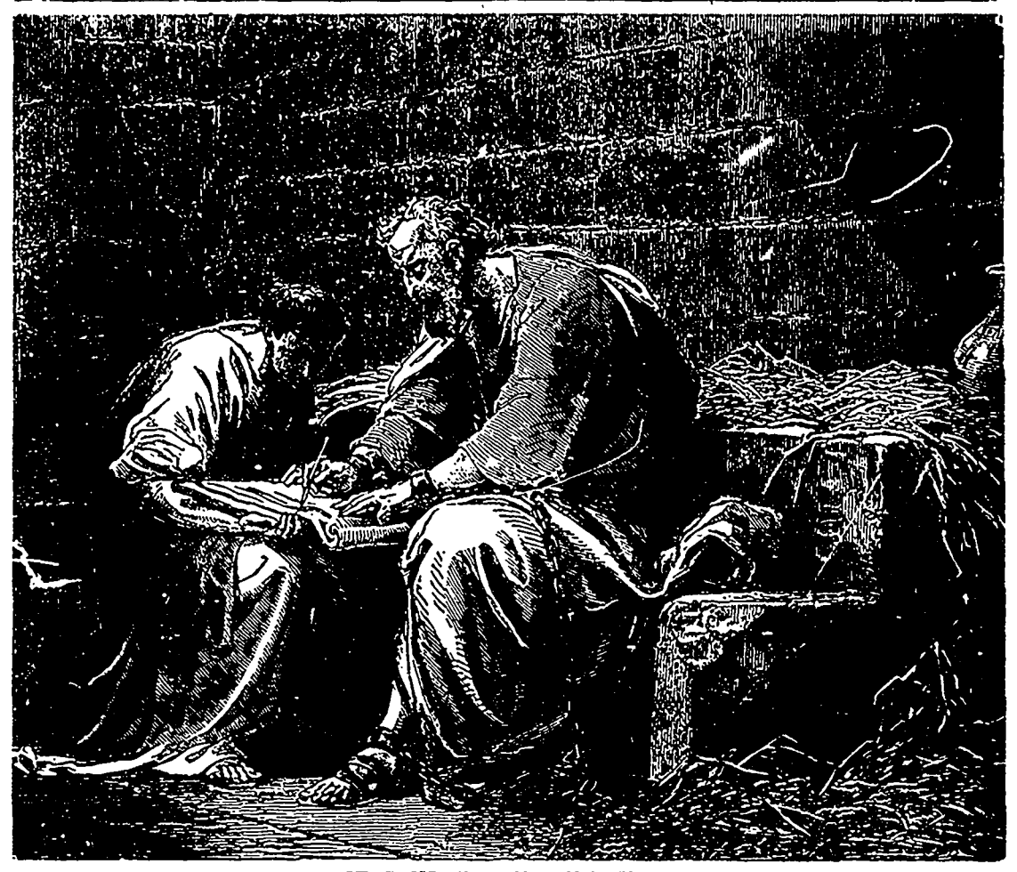
ST. PAUL WRITING IN PRISON.