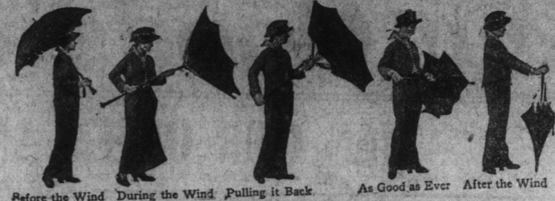
Before the Wind During the Wind Pulling it Back As Good as Ever After the Wind

Our Spring weather is usually accompanied by rain storms. Why not be prepared? Our Wind-brellas are just the thing for wet and windy weather as if they blow inside out you can pull them back again without breaking the Umbrella.