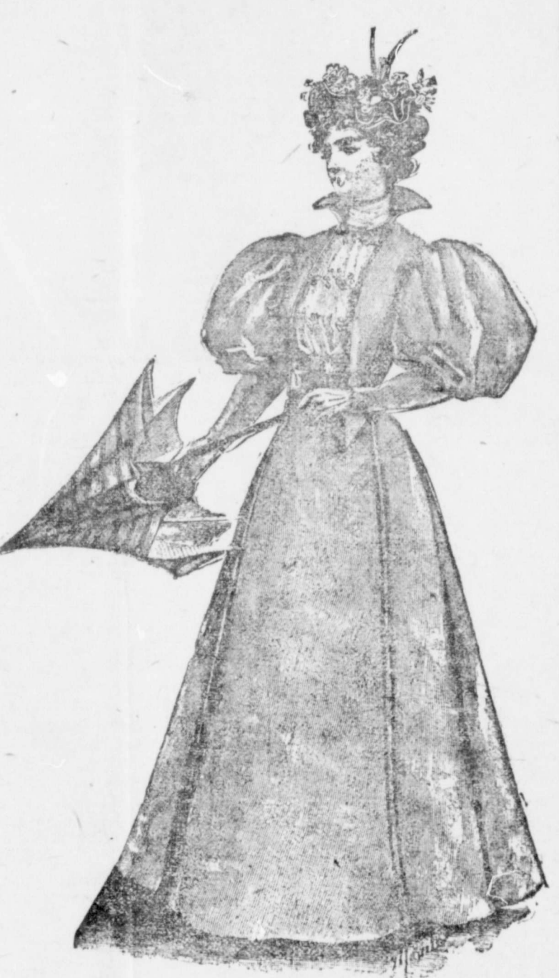
GOWN WITH JACKET FRONT AND PRINCESS BACK.