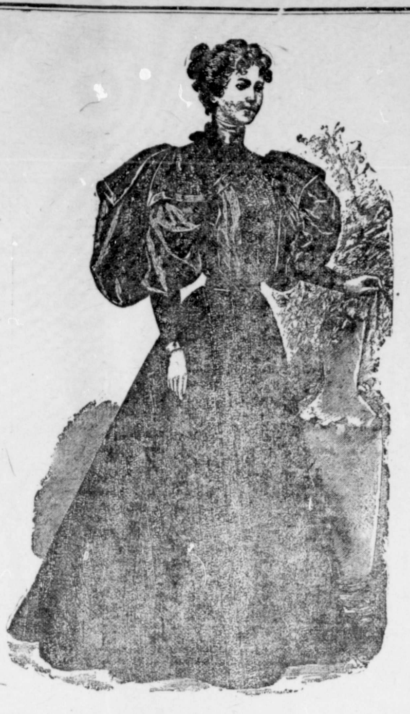
SATIN-STRIPED CREPON GOWN.

During a great part of 1894, 14.4 per cent. of the laborers of France were with-