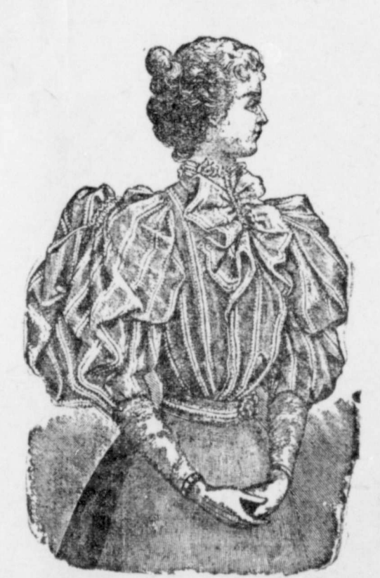
BLOUSE WITH JABOT FRONT.