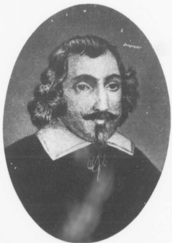
SAMUEL DE CHAMPLAIN,

Founded Quebec, 1608. Visited Algonquin Indian Village on Ottawa River, 1613, and arrived at Huron Country, in present County of Simcoe, August 1st, 1615.