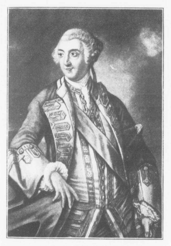
SIR CHARLES SAUNDERS