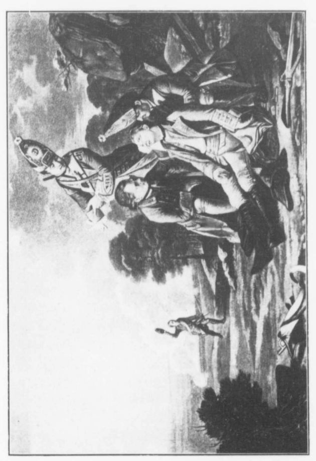
THE DEATH OF WOLFE