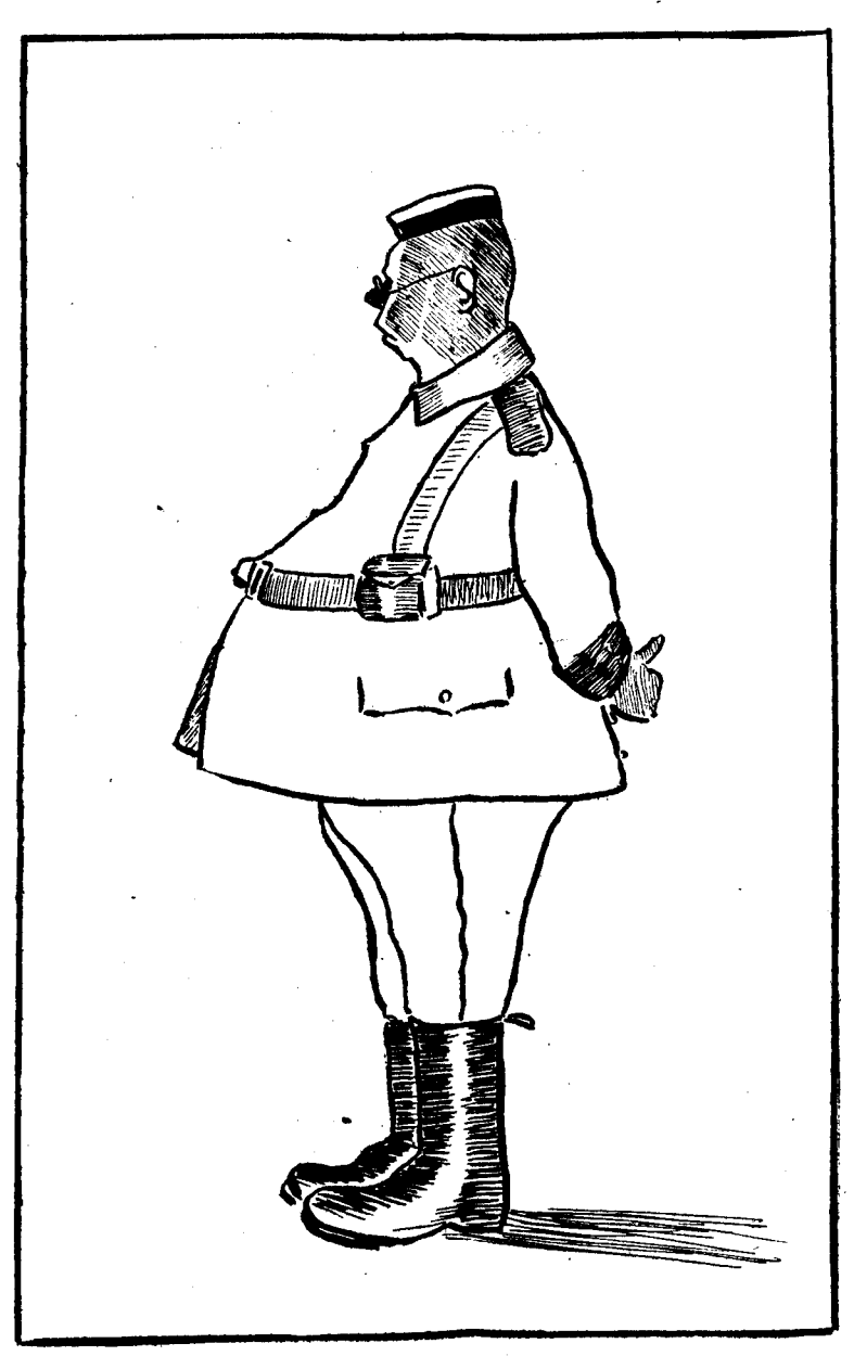
A GREAT WASTE IN THE GERMAN ARMY