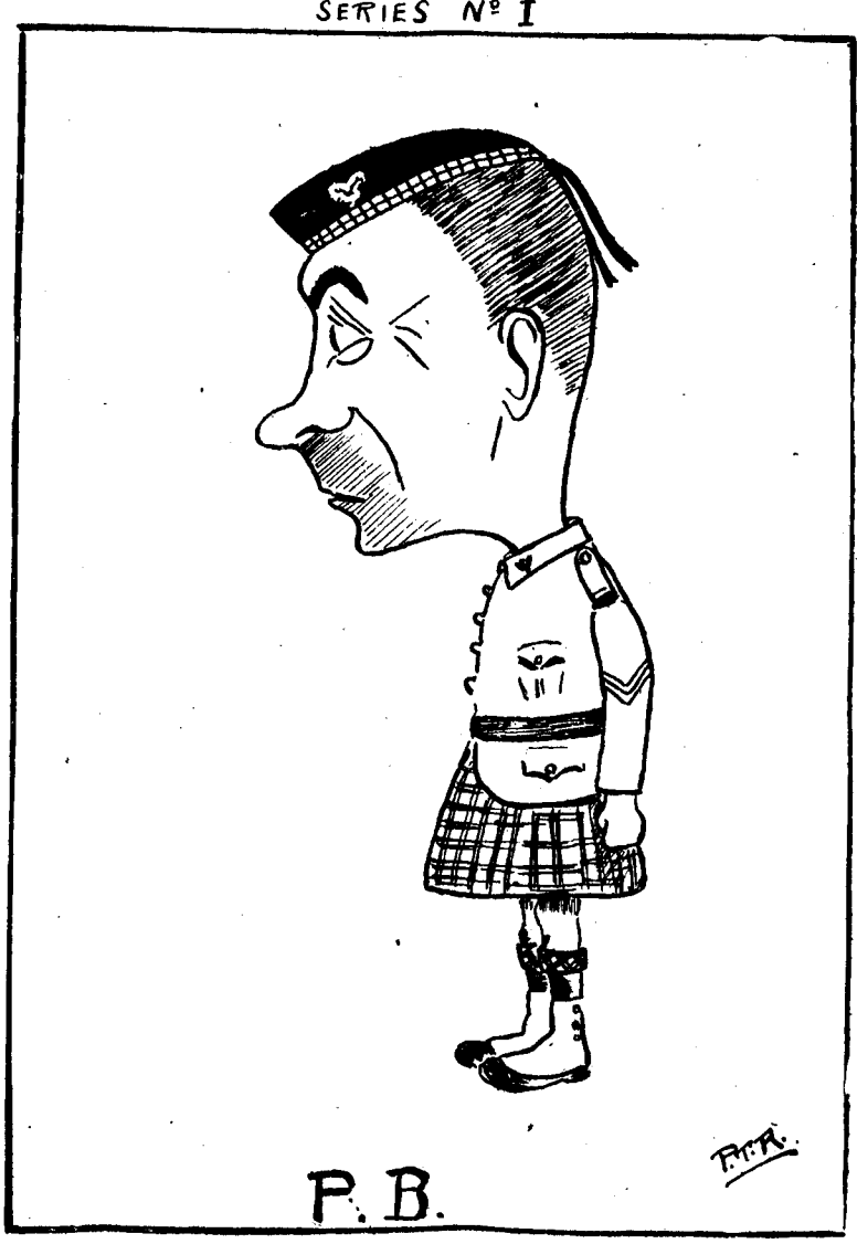
CELEBRITIES OF THE ECHELON. SERIES Nº I