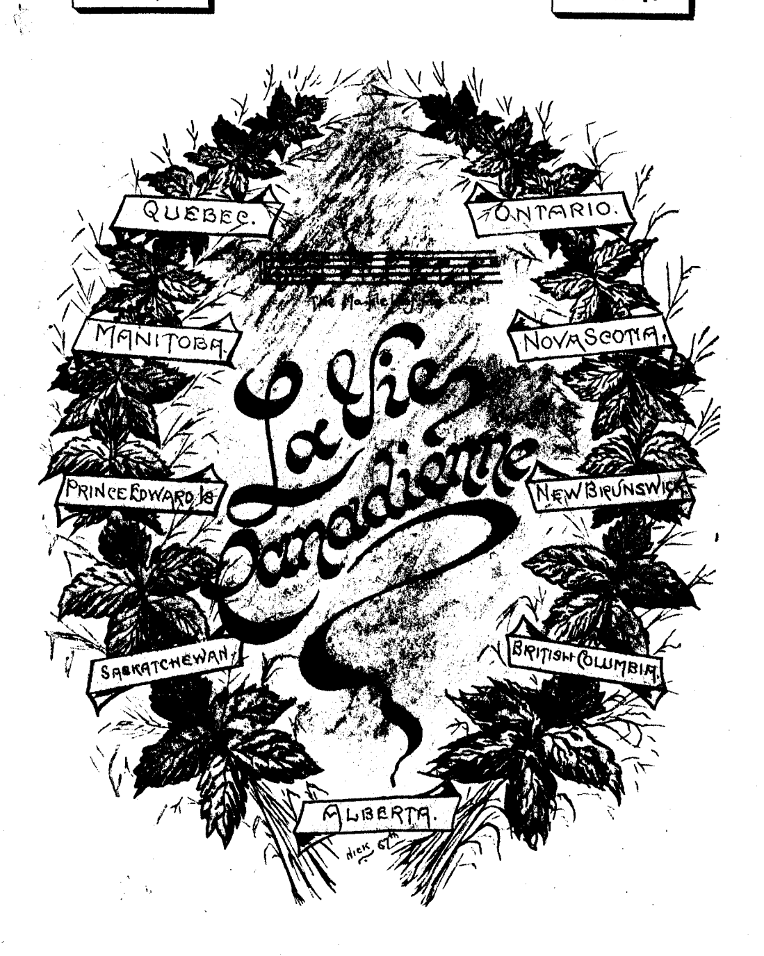
Canadian Section. General Headquarters, 3rd Echelon