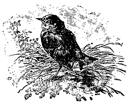
THE SONG OF BIRDS.

The rustle of the leaves, the murmur of the waving grain, the music of the rain's drip, drip, from the trees above their nests and the laughing gurgling of the brook is voiced in the beautiful song of birds. They tell us in sweetest music of nature's perfect harmony and the glory of the daybreak. The inspiration of resting on sunny clouds with the'r little bodies filled with purest, most intoxicating air is expressed in their wonderful trill. What happiness and trustfulness and peace seem to belong to the bird: