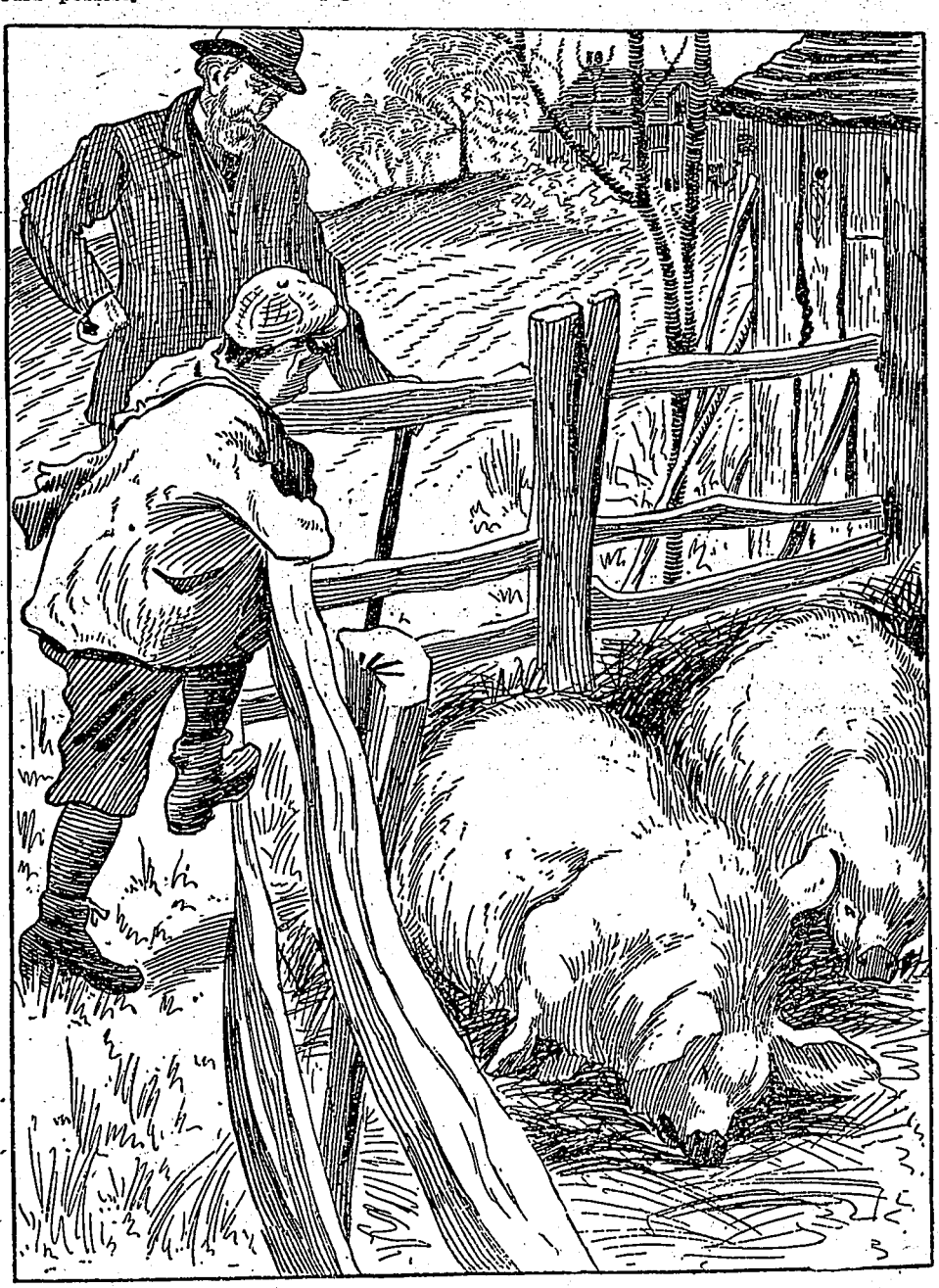
TWO BURTON PIGS.

pigs!' 'No, not silly,' answered the gentleman; 'the pigs did not know what effect the barm would have upon them, or they would have been far too sensible to take it. They trusted those who ought to have known better, and they are suffering for it.' Men, and, alas! women, too, drink too much, knowing that they will sink lower than the beasts that perish—knowing the sin and yet committing it. The bad effect of alcohol on a pig is a bodily effect only,