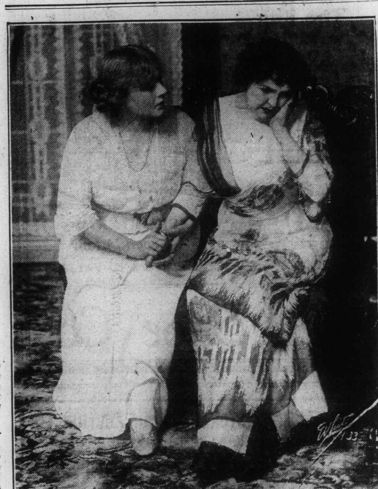
A SCENE IN POTASH-PERLMUTTER THE GREAT COMEDY HIT THAT PLEASED TORONTO TWICE, COMING TO THE GRAND, THURSDAY, MARCH 16TH.

FLOUR CANADO SHE is one of some Three Million Belgians who, since they refused to sell their honor to Germany, have lived on the brink of starvation. A thriving industrial people, used to lite's comforts, they have been reduced to a state where they dream, not of luxuries or pleasures, but of having enough to eat!. True to their character as the war has unmasked it, the Germans callously refuse to help the starving. The task of feeding them has been undertaken by Belgium's Allies and Neutral Nations, through the provided by voluntary contributions and administered with wonderful economy and efficiency by a neutral in plenty. The Fund needs regular weekly or monthly contributions rather than larger but spasmodic gifts. Let us plan to deny ourselves, if necessary—share with our needy Allies—and help to save their lives. Absolutely none of the supplies go to Germans, and most of the food taken into the country is paid for by Belgians who have still a little money. But to feed those who cannot pay, nearly $2,500,000 a month is peeded! Send your contributions to Local or Provincial