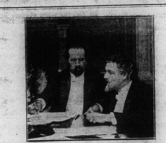
Special Lasky Production in Mr. Prex of Monte Carlo, Brant, Monday, Tuesday and Wednesday.