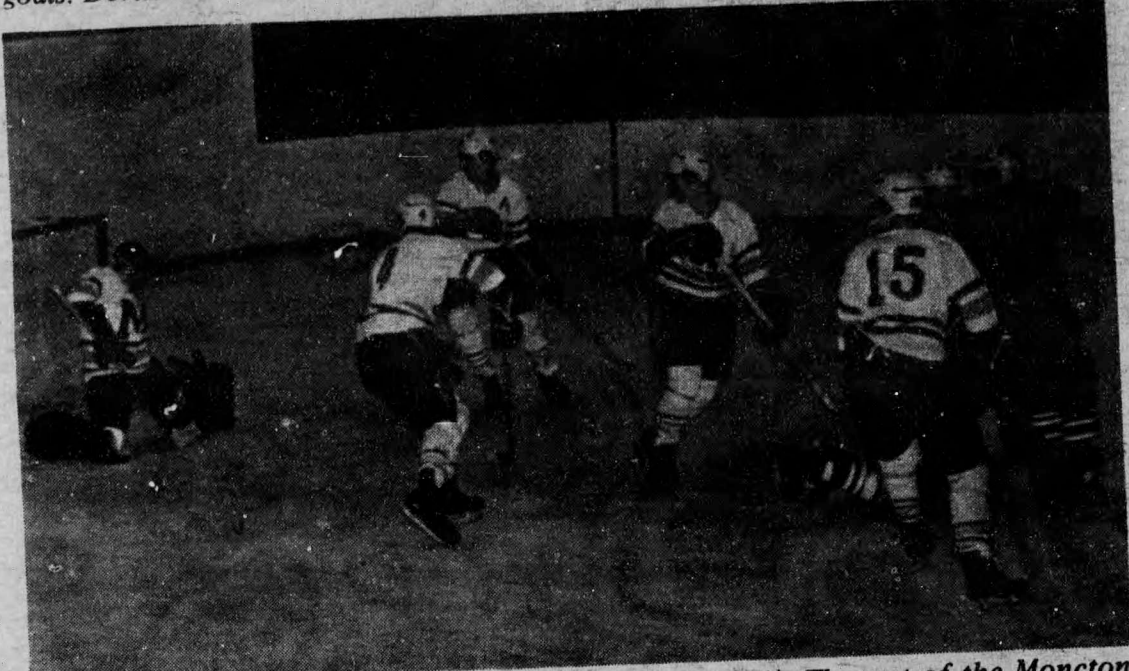
Moncton goalie kicks away a shot by Blaine Walsh (14). The rest of the Moncton players stare behind themselves, looking for the puck.