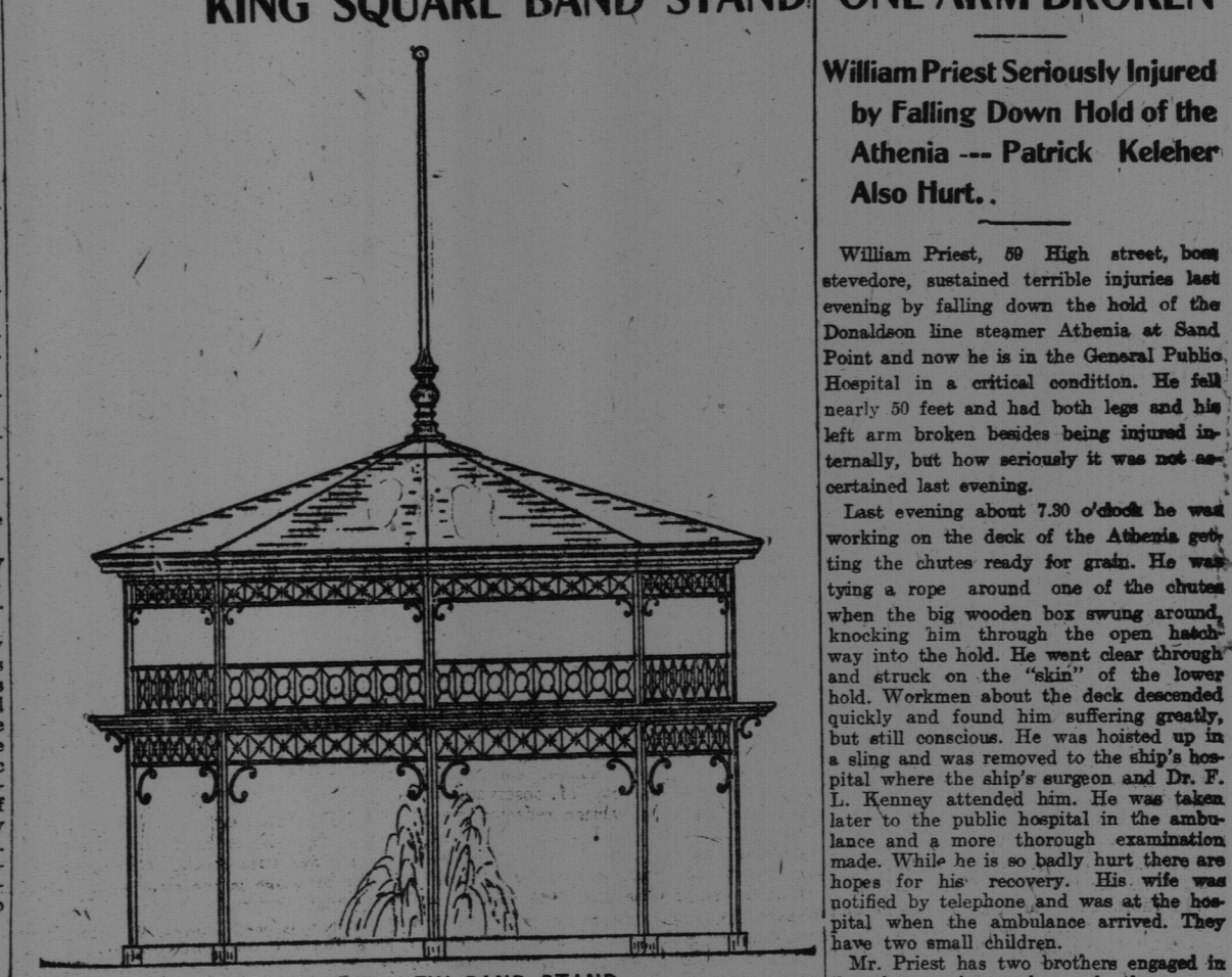
THE PROPOSED NEW BAND STAND.