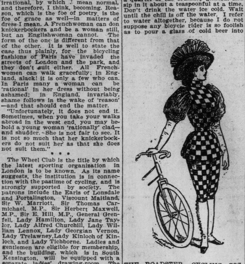
THE ROADSTER CYCLING COSTUME.