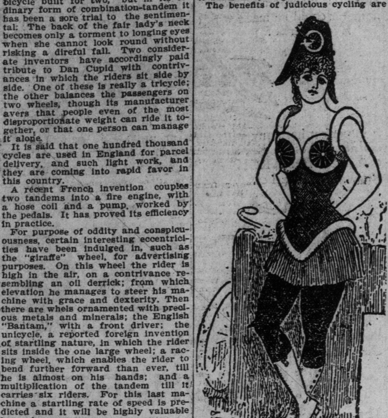
THE PNEUMATIC CYCLING COSTUME.

"I entered the street, struck the first street at right angles, and did not know whether to turn to the right or left..."