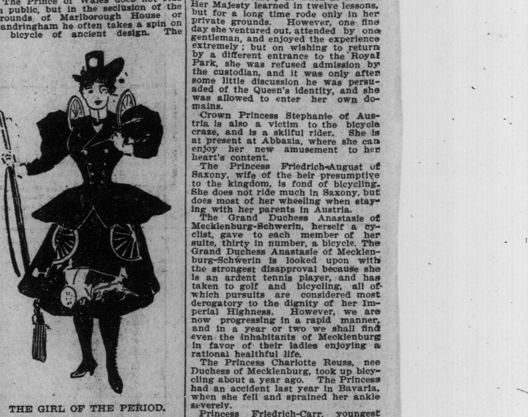
THE GIRL OF THE PERIOD.