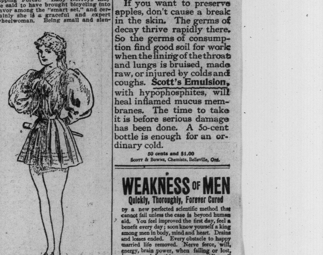
THE GIRL OF THE PERIOD.