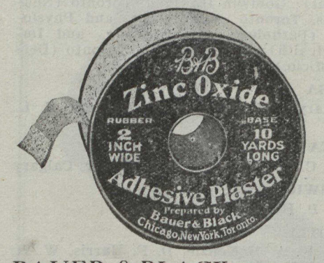
BAUER & BLACK, Limited Toronto, Canada Makers of Sterile Surgical Dressings and Allied Products

For 27 years we have sought to perfect them in scientific ways.