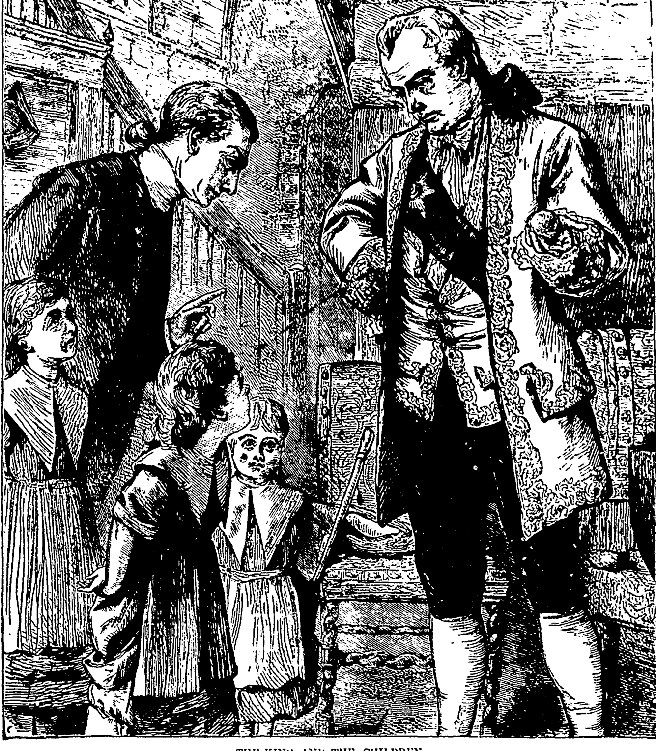
THE KING AND THE CHILDREN.

hand to take the cents. the room. The door was open, but no one was in the entry.