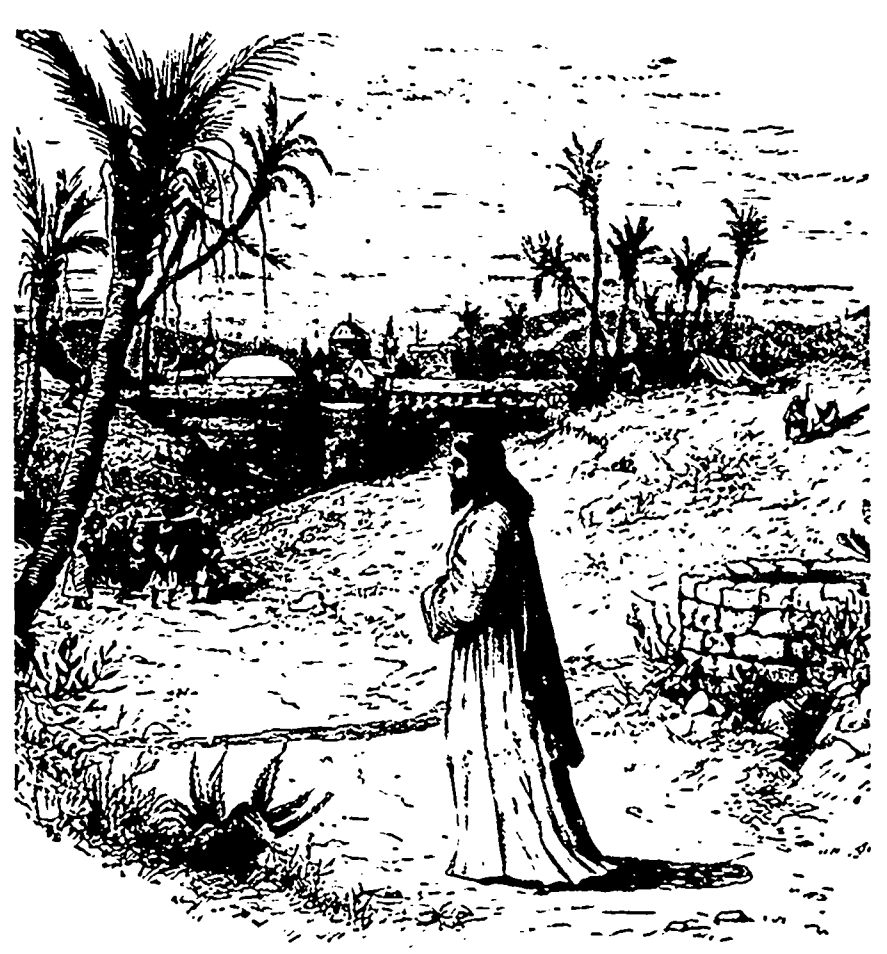
THE FUNERAL AT NAIN.

kerchief for the head, the red fillet swinging reddish golden where most strongly touched loose down his side. Except the fillet and a by the sun. Under a broad, low forehead, narrow border at the lower edge of the under black, well-arched eyebrows beamed talith, his attire was of linen, yellowed with eyes, dark-blue, large, and softened to other than the tion should be extended to the tassels, length sometimes seen on children, but