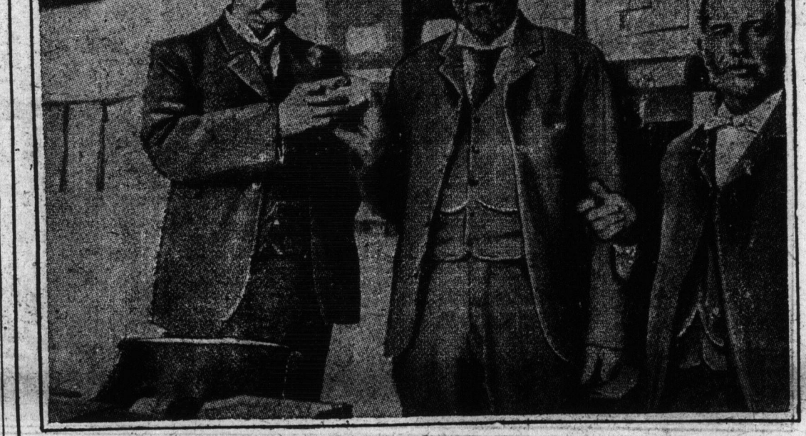
THE GREAT PREMIER DIAMOND THE NEWLY DISCOVERED TWEEL, THE LARGEST IN THE WORLD. WEIGHT 3038 CARATS AND MEASURES 4 1/2 IN BY 1 1/2 IN. EXACT SIZE.

Nevertheless, the old human wretchedness still cries out in every one of us and some who are renewed by it, despising by all that nothingness, and who are saturated by that vanity, thirst for that which endures. These are the disciples who are required by the masters of the higher life, on the condition that their thirst should be quenched by the desire, but also by decision.