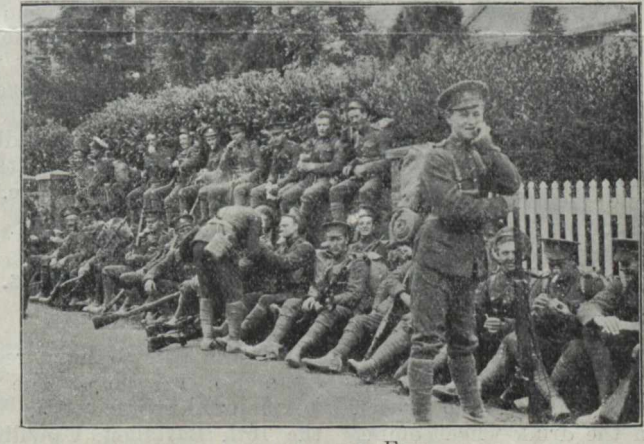
. . . AND FILE.