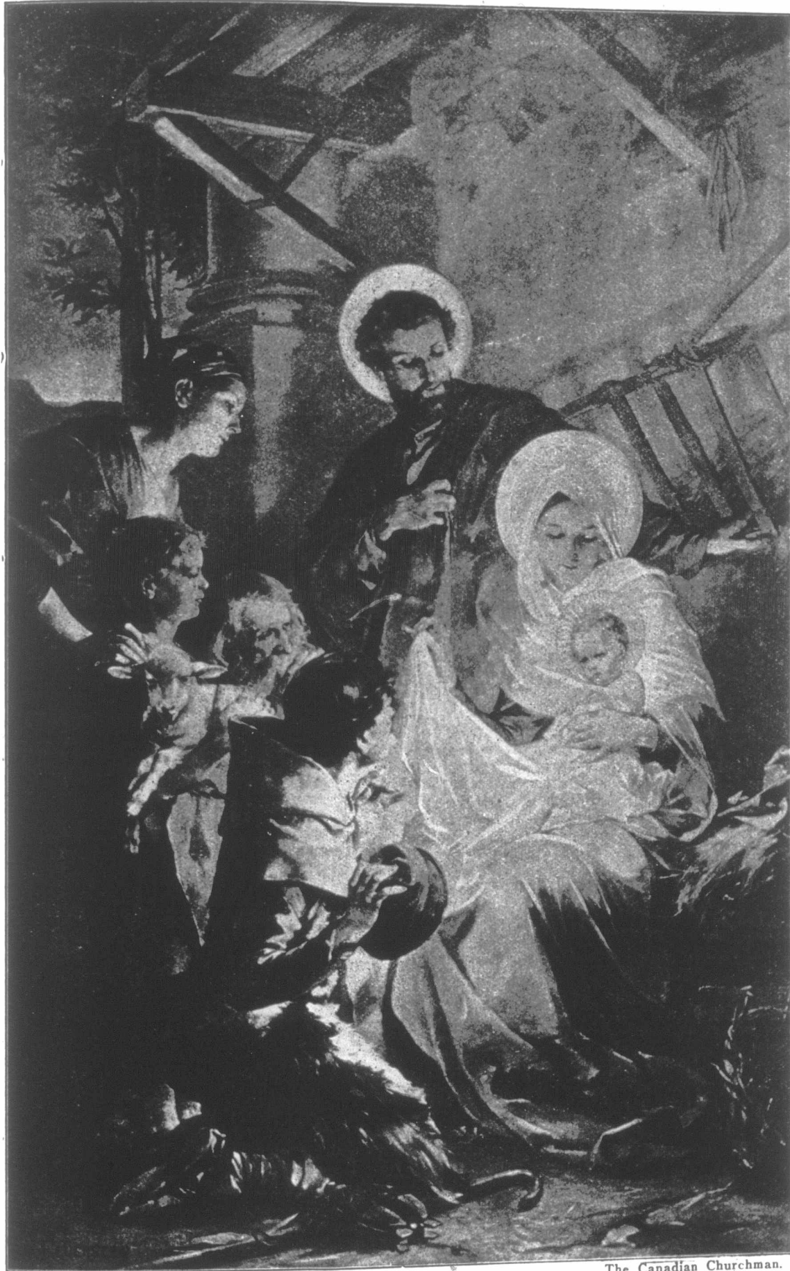
The Canadian Churchman.

Then, again, there is a second message which comes to the Church from the Mission-field. It