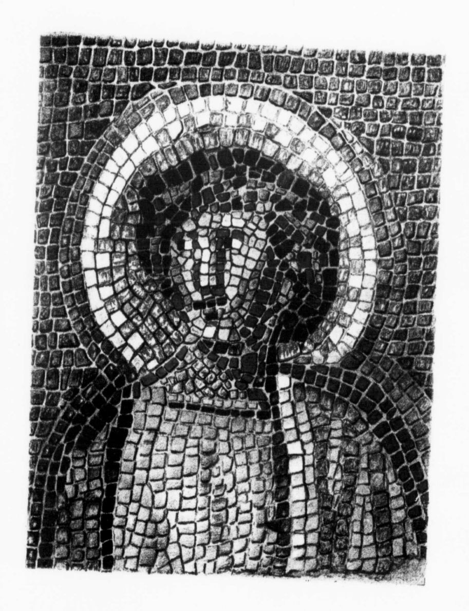
ANGELS HEAD IN MOSAIC. SANTA MARIA MAGGIORE-ROME.