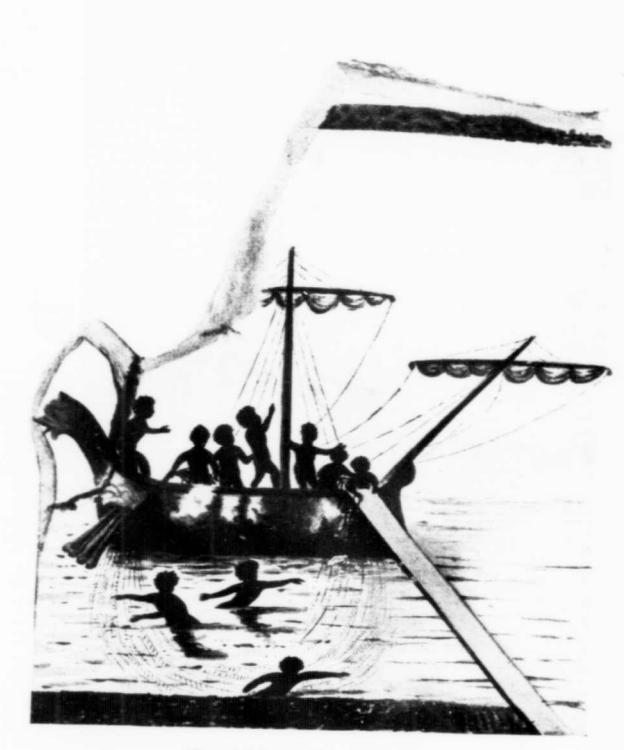
The Ship of the Church (Fresco from the Catacombs of Caglieri)