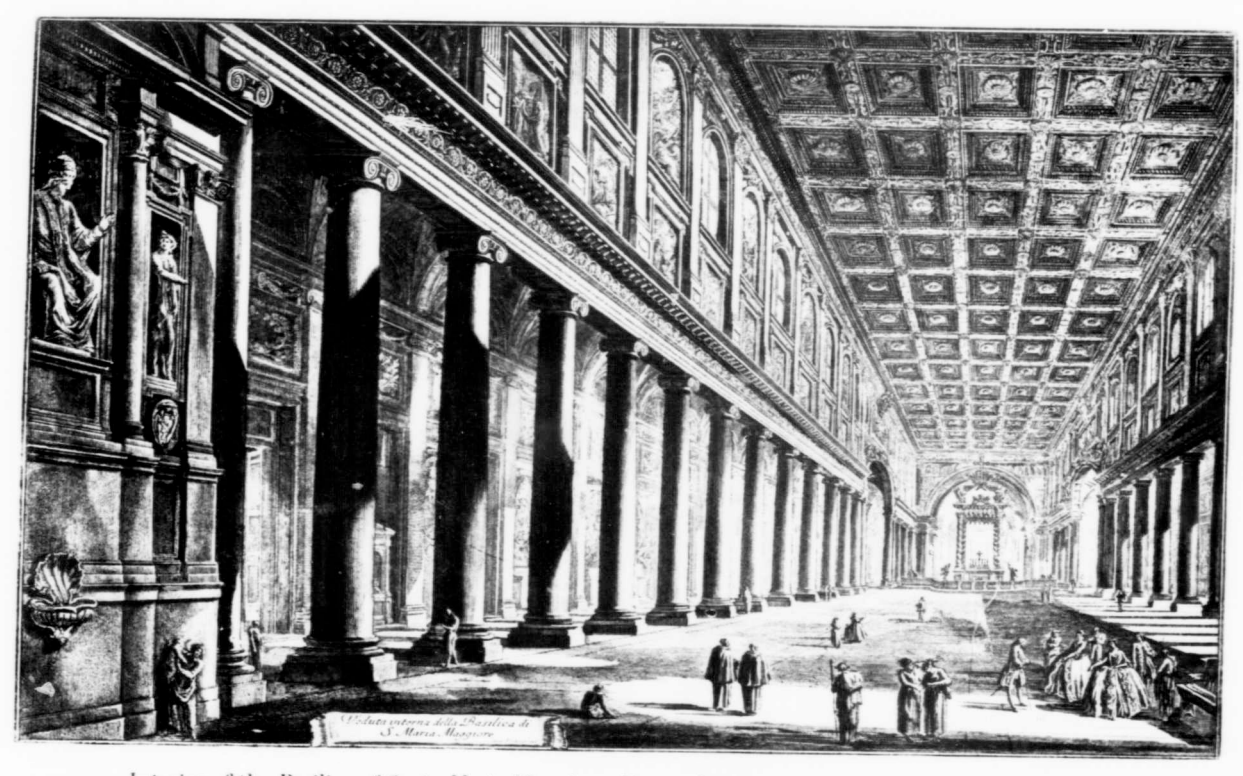
Interior of the Basilica of Santa Maria Maggiore, Rome, showing position of mosaics (after Piranesi)