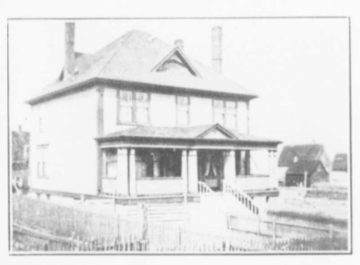
GRAND BANK PARSONAGE. Built and occupied 1914.