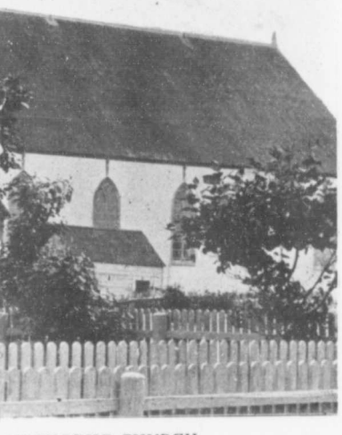
METHODIST CHURCH Milligan, Oct. 4th, 1876.