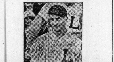
Of the sixteen big time clubs will be found getting the kinks out of winter-bound muscles under the Lone Star flag.

Florida and Arkansas are tied with two each, Washington and the Philadelphia Nationals picking the former and the Boston Americans and Pittsburgh Pirates selecting the latter. The Chicago Cubs are all by their lonesome in the selection of California.